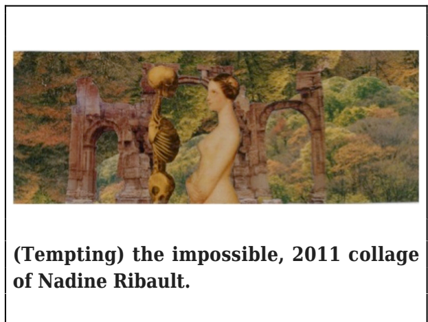
(Tempting) the impossible, 2011 collage of Nadine Ribault.

There are signs that the assessment of the nuclear situation in Japan, after the Fukushima disaster, might prove the French ecologist's analysis to be premature.