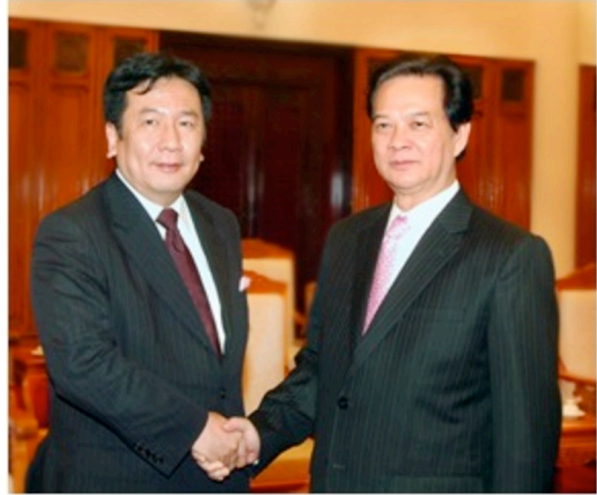
Prime Minister Nguyen Tan Dung (right) and Japanese Minister of Economy, Trade and Industry Edano Yukio in Hanoi.

"Drawing on lessons from the Fukushima nuclear accident, we want to help (Vietnam) build nuclear power plants with the highest level of safety". "Bearing in mind lessons from the accident at the Fukushima No. 1 plant, we'd like to promote this collaborative effort by sharing our experiences with your country," continued Edano . [See also Kimura Sato, Japanese Nuclear Power Generation Comes to a Vietnamese Village http://japanfocus.org/-Kimura-Satoru/3824 With this alchemy, Japan's nuclear disaster is turned into an asset to assure the Vietnamese purchaser of Japan's technical expertise.