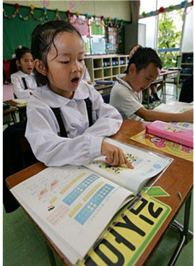
Resident Korean children at Chongryun school

Korean activists and Japanese educators who launched the multicultural educational movement in Osaka City respected the assertion of the 1948 protests, namely, Koreans' right to maintain the culture and identity of their homeland. The activists tried to maintain ethnic classes, which stressed the national culture of the homeland, and used those classes as a model for the ethnic classes they created. The city's Korean community, the largest in Osaka Prefecture, also stressed a culture orientation toward ethnic education. Koreans began to settle in Osaka in the 1920s and by the 1940s many operated independent businesses or were employed as skilled workers.[28] In those districts with high concentrations of Koreans, including Ikaino where about a quarter of residents were Koreans, Korean culture was played out in everyday life. The city was also home to many Korean political organizations, including the major branches of Mindan and Chongryun, which fostered political debate about the divided homeland among Koreans. These factors contributed to the formation of the ethnic-culture approach, which focused on the concept of ethnic nation ( minzoku ) as understood in relation to the Korean homeland. However, it was ultimately the political orientation of people involved in the movement that shaped Korean ethnic education.