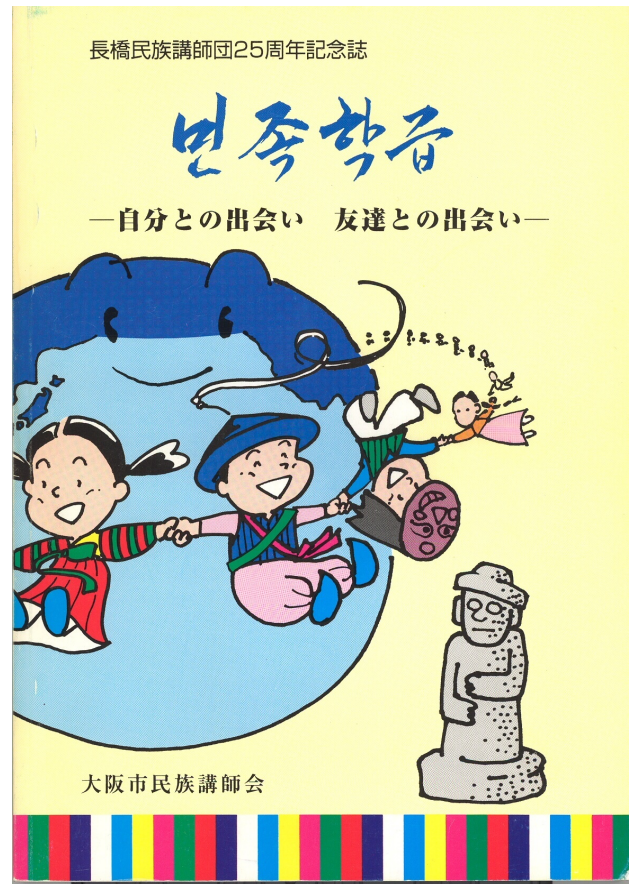
Booklet celebrating the 25th anniversary of the association of Korean instructors in Nagahashi

influential in shaping the content of ethnic education in Osaka City.