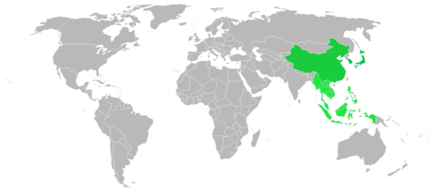
ASEAN Plus Three

Even more important, these countries have built up financial reserves by running massive trade surpluses, an objective they have achieved by keeping their currencies undervalued. Between 2001 and 2005, according to Nobel laureate Joseph Stiglitz, eight East Asian countries -- Japan, China, South Korea, Singapore, Malaysia, Thailand, Indonesia, and the Philippines -- more than doubled their total reserves, from roughly $1 trillion to $2.3 trillion. China, the leader of the pack, is estimated to now have over $900 billion in reserves, followed by Japan.