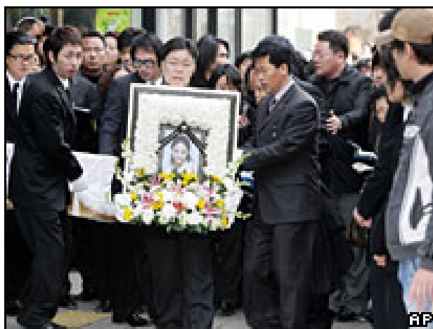
The suicide of a successful South Korean actress brought the spiraling suicide rate to public attention in 2007

The IMF has touted Korea as a "success story." However, Koreans hate the Fund and point to the high social costs of the so-called success. According to South Korean government figures, the proportion of the population living below the "minimum livelihood income" -- a measure of the poverty rate -- rose from 3.1 per cent in 1996 to 8.2 per cent in 2000 to 11.6 per cent in early 2006. The Gini coefficient that measures inequality jumped from 0.27 to 0.34. Social solidarity is unraveling, with emigration, family desertion, and divorce rising alarmingly, along with the skyrocketing suicide rate. "We have one big unhappy society that looks back to the pre-crisis period as the golden age," says Chang.