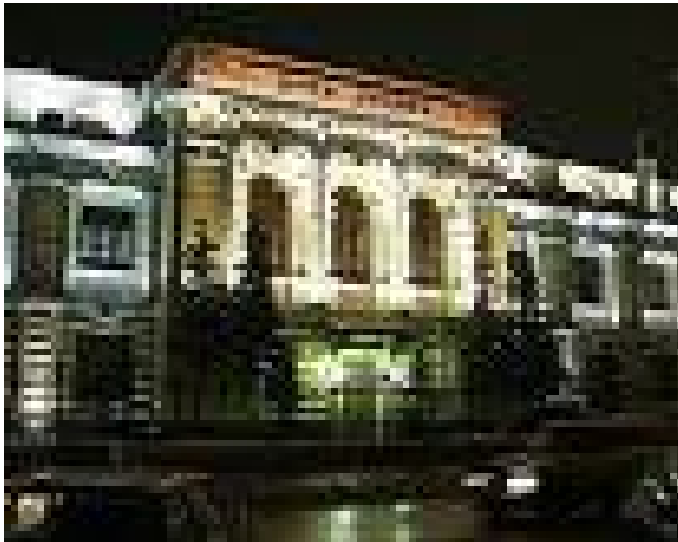
A private Russian bank received the North Korean funds

pointed out that “The American side promised to resolve the financial question, and this promise was not fulfilled”. [12] Russia can play a significant role in the upgrading of the North Korea railway network, something which could assume major importance if the rejoining of Northern and Southern railways is really taken beyond the technical stage. [13] There have been rumours of a resolution of North Korea’s reportedly $8 billion debt to Russia inherited from the Soviet Union and a rail upgrading could resuscitate trade between the two. [14] Nevertheless, for reasons of geography as well as power, Russia carries less weight in the talks than the other countries.