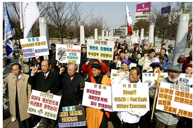
Anti-war, anti-military exercise protest in Seoul on March 12, 2003

It is likely that the joint US-ROK military exercise Ulji Focus Lens scheduled for 20-31 August will be put on hold. The South Korean and US military hold two joint exercises, involving amphibious landings, each year. Apart from the fun of it (boys with toys), and the usefulness of practice manoeuvres, these seem to have two functions. One is to persuade the South Korean public that there is really a threat from the north, and the other is to put pressure on the northern military. They have high symbolic value and incur regular protests from North Korea and from progressive groups in South Korea.[61] The government in Pyongyang has traditionally regarded Seoul as an appendage of Washington, much to the chagrin of South Korea, so if the exercises go ahead Roh Moo-hyun's credibility as a president of the Republic of Korea, independent of America and in command of his own military, would be seriously compromised.[62]