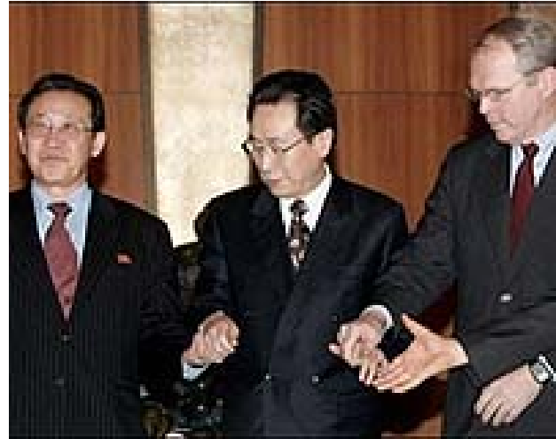
Chinese Vice Foreign Minister Wu Dawei joins hands with North Korean negotiator Kim Gye Gwan and his US counterpart Christopher Hill

It is a curious business. It appears that in the January talks in Berlin Hill agreed to the lifting of sanctions and it was reported by the Washington Post that there was an unpublished 'side agreement' to the public one in which "the United States promised to resolve within 30 days a Treasury Department case that had frozen North Korean funds at a bank in Macau suspected of distributing dollars counterfeited in North Korea"; that is the BDA.[28] In April the DPRK Foreign Ministry reiterated that they would move to implement the February Agreement "only when lifting of financial sanction proved to be reality." [29]