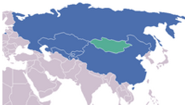
Map showing SCO military exercises centered on Xinjiang

The government-owned China Daily underlined that the exercises show that "SCO cooperation over security has gone beyond the issues of regional disarmament and borders, for it includes how to deal with non-traditional threats such as terrorists, secessionist forces and extremist religious groups".