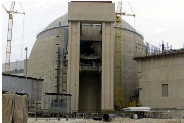
The main building of the Bushehr nuclear power plant (2003)

nuclear power plant in Iran. Indeed, Russia has "politicized" the issue and is unlikely to dispatch nuclear fuel for Bushehr as long as the Iran nuclear file remains open. Despite the chill in Russian-US relations, Washington and Moscow have always closed ranks on issues affecting the preservation of the "nuclear club".