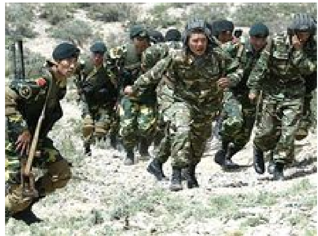
SCO military exercise in Kyrgyzstan

Therefore, the Shanghai Cooperation Organization is indeed making a very big point by way of holding its large-scale military exercises from August 9-17. The SCO is loudly proclaiming to the international community that there is no "vacuum" in Central Asia's strategic space that needs to be filled by security organizations from outside the region.