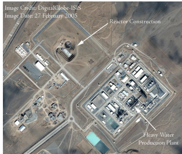
Arak heavy-water plant in 2005 satellite image

and as evidence that "Iranians are ready to give the IAEA exhaustive answers".