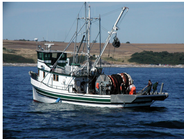
Fishing boat with purse seine

large capacity (and therefore potentially ecologically destructive efficiency) [31]. It was not just the environmental effects of purse seining that caused contention. The Japanese-favored pole-and-line method is very labor intensive, and so over a certain level of catch it is cheaper to use the very large purse seine ships with labor saving technologies. Since the 1990s purse seine caught tuna has therefore all but killed international markets for the more expensive pole-and-line caught skipjack, of which Japanese companies were the major producers.