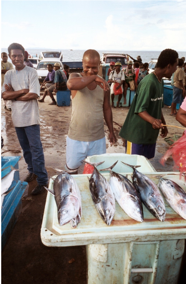
Skipjack at Honiara Market

Solomon Taiyo's main form of fishing was pole-and-line (called 'poling' in Australia and ipponzuri in Japanese) for skipjack. This is a low technology, high labor form of fishing with very low bycatch levels, and that can produce high quality meat. The skipjack fishery was in the open sea outside the reefs and lagoons. Solomon Taiyo's pole-and-line fishery had an associated bait fishery to catch small shiny silver and Western fish that were 'chummed' (scattered) live across the surface above schooling skipjack to induce a feeding frenzy and encourage skipjack to snap at the shiny hooks on the lines. The baitfish were caught by bouke-ami nets at night in lagoons using lights to attract the fish. They were stored live in wells in the hold of fishing ships to be used the following day.