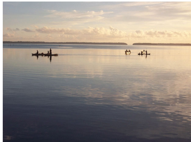
Travel brochure image of Solomon Islands fishing

Westerners who have worked closely with Japanese fisheries, such as government officials who work with Japanese government and company representatives on international fisheries issues, generally identify Japanese fisheries negotiators as 'very tough' but reliable in honoring agreements [9]. Such representations by well-informed commentators do not talk of a monolithic 'Asian' approach to fisheries, but distinguish Japan from countries such as Korea and Taiwan (and more recently China), seen as more prone to illegal fishing, breaking environmental laws and regulations, and mis-reporting catches (Schurman 1998).