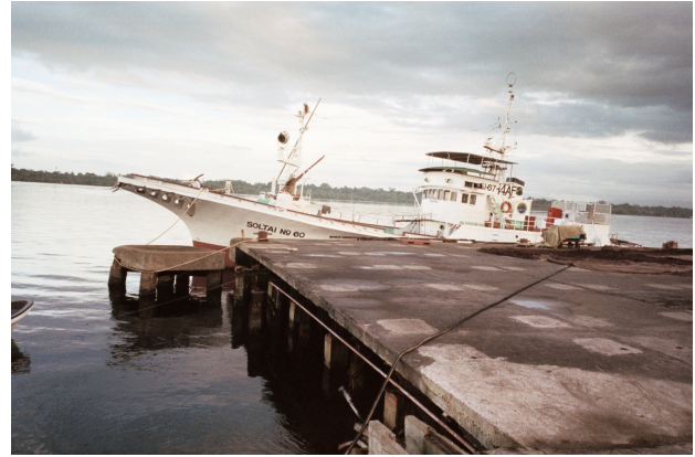
Pole and line vessel

Solomon Taiyo's main form of fishing was pole-and-line (called 'poling' in Australia and ipponzuri in Japanese) for skipjack. This is a low technology, high labor form of fishing with very low bycatch levels, and that can produce high quality meat. The skipjack fishery was in the open sea outside the reefs and lagoons. Solomon Taiyo's pole-and-line fishery had an associated bait fishery to catch small shiny silver and Western fish that were 'chummed' (scattered) live across the surface above schooling skipjack to induce a feeding frenzy and encourage skipjack to snap at the shiny hooks on the lines. The baitfish were caught by bouke-ami nets at night in lagoons using lights to attract the fish. They were stored live in wells in the hold of fishing ships to be used the following day.