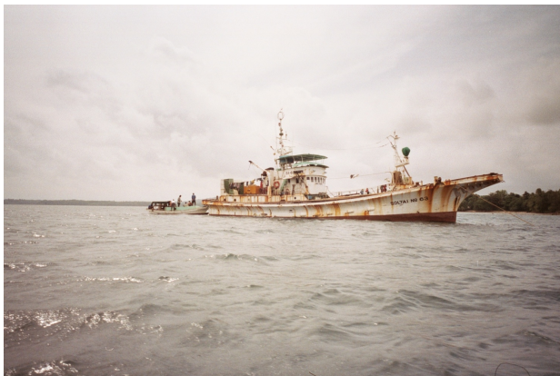
Solomon Taiyo vessel and bait boat

Solomon Taiyo grew steadily over the years until by 1999 it had an annual turnover of around USD$100 million, employed close to 3,000 Solomon Islanders on its fleet of more than twenty fishing boats, and had a large shore base with a canning factory. At start up most employees had been Japanese nationals but over the years the proportion of Solomon Islander employees increased. In 1999 there were less than ten mainland Japanese managers, and around thirty Okinawan fishermen working for the company. Up to thirty technical positions were filled by short-term contractors from the Philippines and Fiji, but the rest of the workforce, including some senior management, most middle management and technical supervisory positions, were filled by Solomon Islanders. Since the mid 1980s the company had been 51 percent owned by the Solomon Islands government, with the Japanese partner company owning the remaining 49 percent of shares, and appointments to the Board of Directors were balanced between the two shareholders.