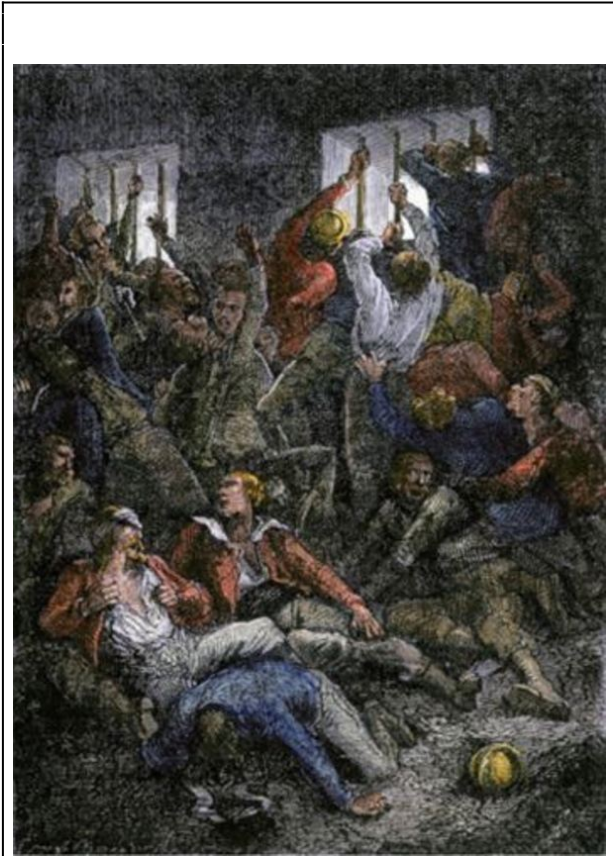
English officers in the Black Hole

conceptual changes in those disciplinary knowledges of power. That is my method. To a large extent, I had to invent it. Whether it works or not is for readers like you to judge.