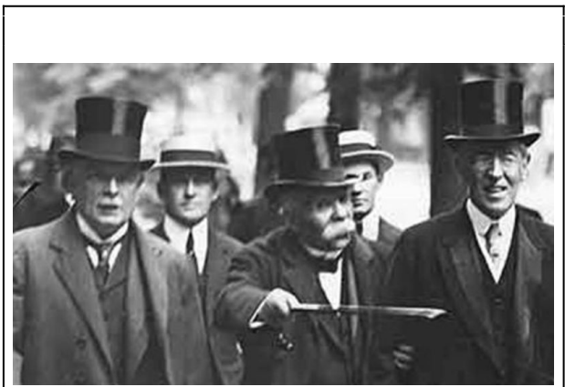
Lloyd George, Georges Clemenceau and Woodrow Wilson arriving at Versailles at the end of World War I

unintended consequence in what came after. I think the League of Nations did provide a skeletal framework for a global order in which equal sovereignty of nation-states would be the basic form but in which British hegemony would be superseded by a collective dominance of Western powers led by the economic dominance of the United States. Karl Polanyi’s The Great Transformation is an instructive lesson in the underlying changes that were taking place in the inter-war years in the global system.