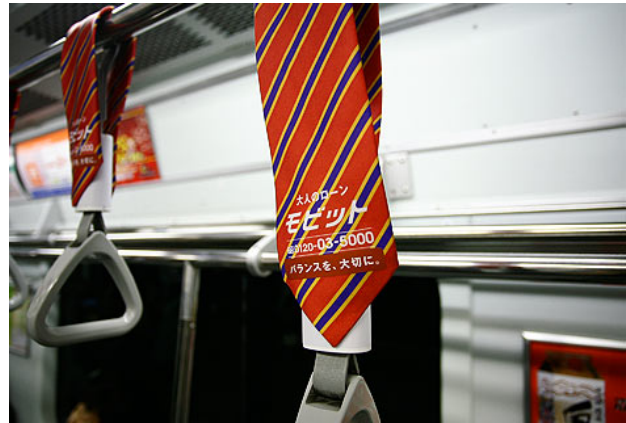
Subway ad for a loan company