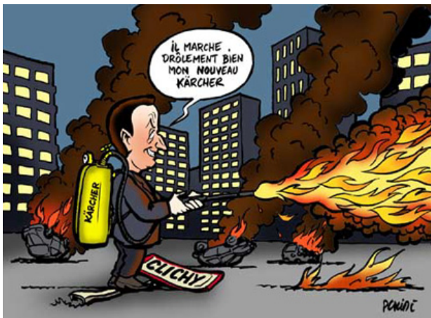
Cartoonist depicts Sarkozy's 2005 plan to clean up the

In 2005, while Sarkozy was minister of the interior, his comment about "social trash" triggered riots in suburban Paris. It is based on an extremely nihilistic view--which also suits his philosophy to strengthen supremacy--that it is inevitable that an economically liberal society produces social dropouts and a powerful mechanism is needed to "clean up" such "trash" that opposes the establishment.