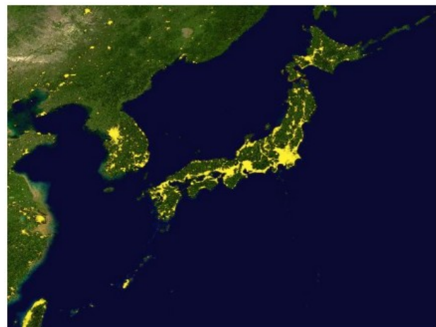
Fig. 3. Nighttime satellite image of Japan's lights superimposed on a daylight satellite image of the archipelago and its eastern neighbors.

Vaclav Smil is Distinguished Professor, University of Manitoba, Canada. His interdisciplinary research has roamed