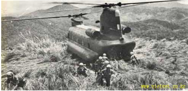
ROK forces in action in Vietnam

The elimination of Pham Minh, the failure of Yong-gyu to act meaningfully, halts the movement from spontaneity to consciousness, leaving Nguyen Thach as “father” to a protagonist who stands beyond the text, who is yet to come. It is at this point that The Shadow of Arms becomes an advocative text, enjoining its readership to reject the global system that has caused Yong-gyu to kill Pham Minh—the act that locates Yong-gyu as subimperialist—by constructing the positive hero, the revolutionary subject, on the Korean peninsula, in other words, by supplying the form of the defeat of the U.S., of national reunification, of the revolutionary construction of an alternative historical trajectory, with a localized content. The Shadow of Arms calls upon its readers to participate in a remembering of Vietnam that will produce a consciousness, above all, an overcoming of Yong-gyu’s alienation, in 1980s South Korea. It is up to the reader to continue where the text left off in the 1960s, to summon the revolutionary spirit of the student Pham Minh, to open up the possibility of a realignment, a move from “spontaneous” collaboration (Yong-gyu’s killing of Pham Minh) to “conscious” contestation of U.S. neocolonialism and the developmental authoritarian regimes of Chun Doo Hwan and Roh Tae Woo. [9]