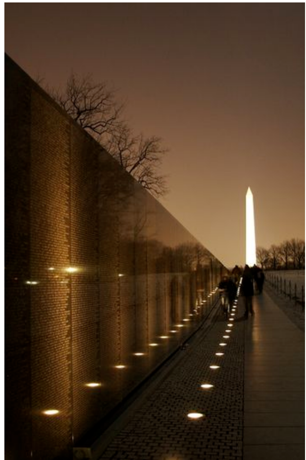
The Vietnam Veterans Memorial with the

The monument, however, produces meaning, and constructs a national narrative, precisely in its performance of differentiation, its exclusion of the deaths of the “other” (the Vietnamese). [2]