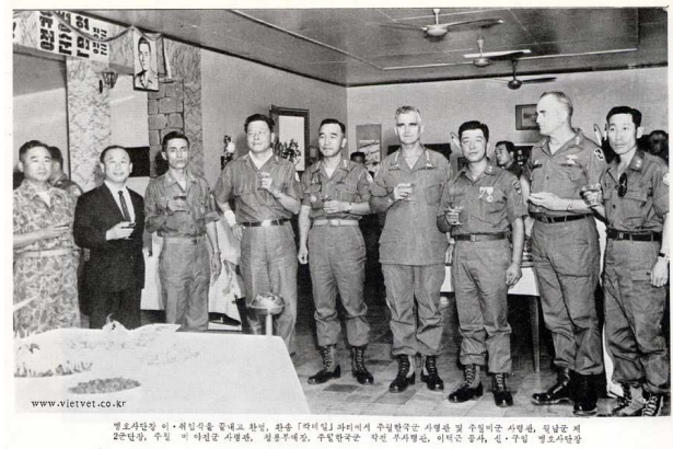
Korean Commanders of “Tiger Division” at a party with American officers, including US Commanding General William Westmoreland (4th right), September 20, 1967. The Division experienced extensive combat during both the Korean and Vietnam Wars.

The monument also elides those who fought on the side of the U.S. during the war: the “more flags” program that brought Australia, New Zealand, the Philippines, South Korea, and Thailand into the war in the mid-1960s does not appear on the screen of the U.S. national imaginary. Americans do not learn in their high school history textbooks that over 300,000 South Korean troops fought in Vietnam, and that over 4,000 of them were killed.