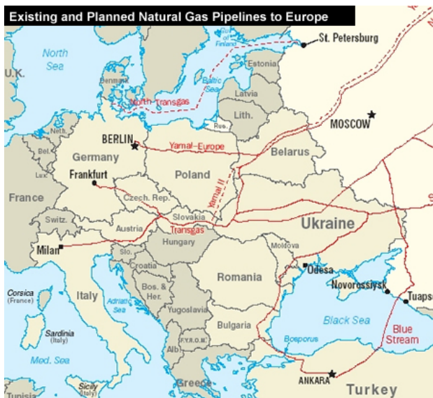
Russian oil and gas routes

The EU's blueprint of its new Central Asia strategy, to be adopted at the EU summit in June, will likely be viewed in Moscow as an unwelcome encroachment, especially given its thrust on developing energy cooperation with the region by bypassing Russian transportation routes.