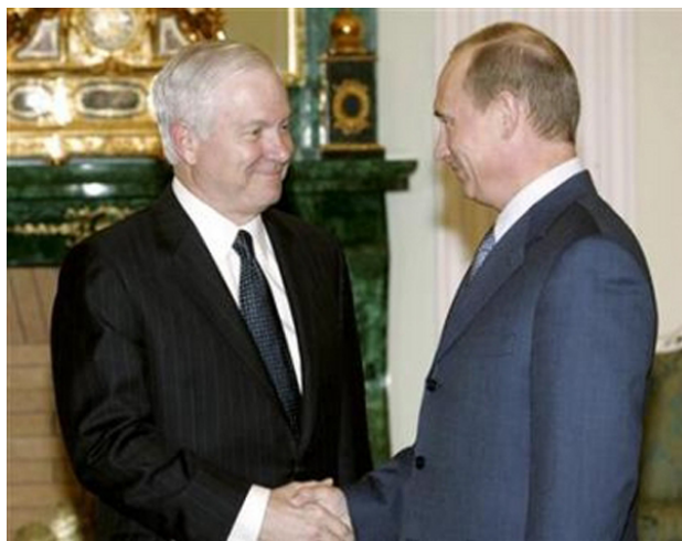
Gates and Putin in Moscow

Hardly had Yeltsin, archetypal symbol of post-Soviet Russia's "Westernism", departed than Gates, one of spymaster John le Carre's "Smiley's people", arrived on a mission to let the Kremlin know that no matter Russian sensitivities, Washington was going ahead with its deployment of missile-defense systems along Russia's borders. Gates reminded the Russians how little had changed since the collapse of the Soviet Union in 1991.