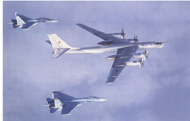
Russia's TU-95MS strategic bomber

about 1,500 ALCMs. Rogov argued that measures such as these will be cost-effective insofar as mass production of ICBMs and ALCMs will cost less than US$1 billion per year - a tiny fraction of the US expenditure in developing the missile-defense system.