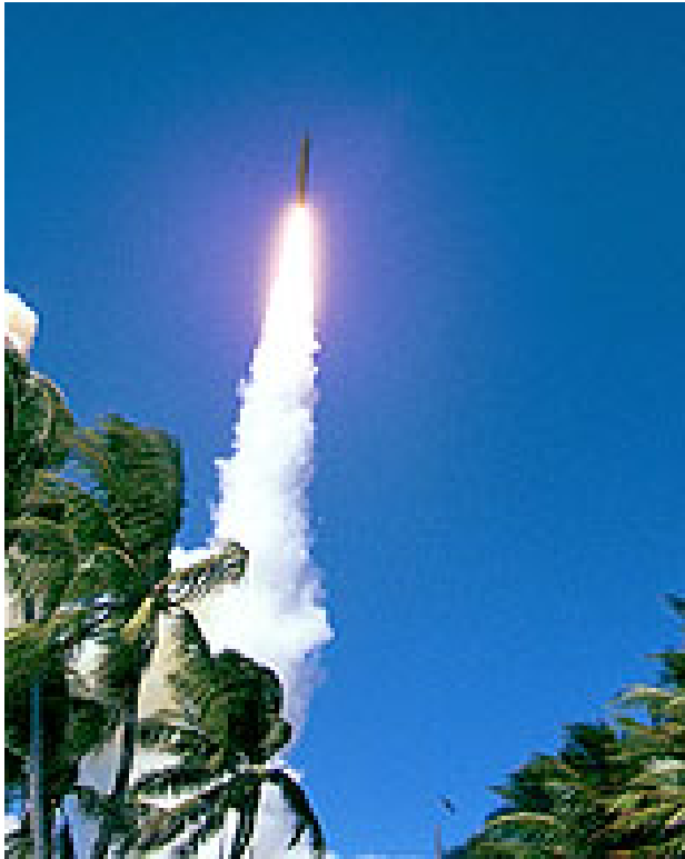
US Missile Interceptor

contemplating in Poland and the Czech Republic. It said that the US is planning to field 10 long-range ground-based missile interceptors in Poland and a mid-course radar in the Czech Republic to counter the growing threat of missile attacks from the Middle East.