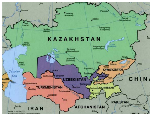
Russia and Central Asia

revolutions", the secretary general of the Collective Security Treaty Organization, General Nikolai Bordyuzha, said in a speech in Almaty on April 19, "Today, it is not only Afghanistan that the entire post-Soviet space is concerned about. There is a problem of the export of revolutions - the problem of attempts to intentionally bring about their elements. And we can see it. Today, there are recognizable people, exporters of revolution, the so-called contemporary revolutionaries - new Che Guevaras - in the post-Soviet space."