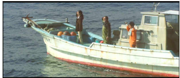
Figure 3: Scene from Otokotachi no Yamato (2005, Dir. Sato) in which three generations unite in saluting the fallen dead of World War II

with the blood, gore, and dismemberment as the faceless enemy ruthlessly sinks the ship. It’s a gruesome portrayal of doomed youth courageously meeting death. In the present-day, the sailor’s daughter and the high school-age boy who helps pilot the fisherman’s ship come to understand the heroism of the Yamato sailors, and, in the end, salute them at the site of the great ship’s demise. Here we see the perfect image of three generations coming to respect the sacrifice made by the sailors.