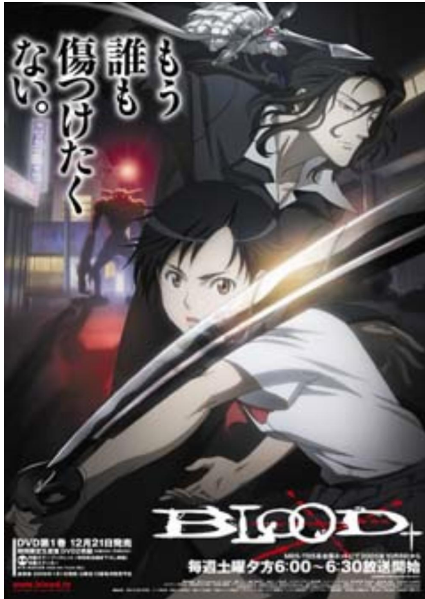
Figure 2: Blood+ poster with Saya and her chevalier Hagi © Production I.G. The poster reads “I don’t want to hurt anyone every again”

Like many Japanese anime, Blood+ deals in part with loyalties and the violence of war. Although some anime, such as Space Battleship Yamato , offered fairly black and white portrayals of “good guys versus bad guys,” since then we find more often the elaboration of gray areas in battle. The original Mobile Suits Gundam series (1979), for example, produced as many fans of Char Aznable, the warrior for the Zeon rebels, as for Amuro Rei, defender of the Earth Federation. That pivotal series stood out for the “reality,” as the creators and fans viewed it, in the portrayal of fear, anxiety, and moral dubiousness of war (Otsuka and Sakakibara 2001: 204-207). The heartbreaking classic film Grave of the Fireflies directed by Takahata Isao (1988) also suggests