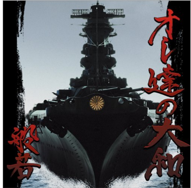
Hannya (2005) Oretachi no Yamato (Avex, Japan [single release])

to the film Otokotachi no Yamato . What makes Hannya’s song so interesting is the way it uses the sinking of the Yamato as an opportunity to examine not the masculinity of military sacrifice (“the men’s” or otokotachi of the film’s title) but what the sinking means for “us” ( oretachi ), that is, today’s Japanese youth.