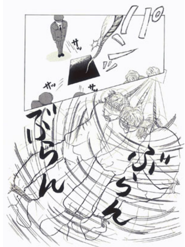
Job done: The trapdoor opens and the inmate is hanged.

The guards' perspective: Prison officers blindfold and handcuff the condemned inmate, put a rope around his neck and position him standing on the trapdoor of the gallows. On a signal, three guards then press buttons that open the trapdoor.