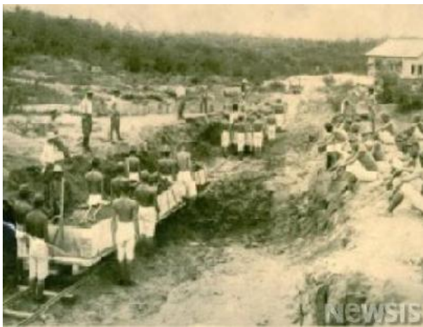
Korean military conscripts on Pacific island circa 1943

The government’s remuneration plan for military conscripts was separate from the corporate deposit system for civilian conscripts, but the final result was identical: Korean conscripts were never paid. The emergence of information about the state scheme underscores the complementary nature of grassroots activism in Japan and South Korea, the cross-fertilization of redress efforts involving various subsets of forced labor, and the privileging by the Japanese government of hardships borne by military personnel above those of civilians.[56]