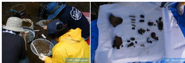
Asian students sift soil for Korean bones in Hokkaido, August 2006

Because Japanese society is sharply divided about the nature of Korean forced labor and labels for describing it, and because there is no strong consensus regarding Japan’s colonial rule of Korea from 1910 to 1945, Japanese remain far from agreement with Koreans about how to come to terms with this major aspect of their nations’ shared past. However, doing nothing about the legacy of forced labor, the prevailing approach for the past six decades, is no longer an option. The singularly complex and dynamic Korean forced labor reparations movement is being empowered by the direct involvement of the South Korean state and the activities of a transnational civil society that are without parallel in Asia or perhaps anywhere.