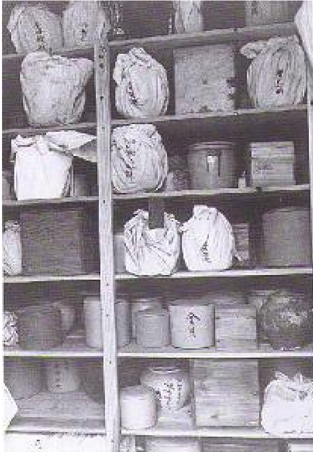
Tsubo bearing Korean names at Saishoji Temple in Chikuhō, 1970s