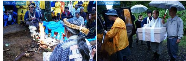
Ainu memorial rites for Korean forced laborers in Hokkaido and remains headed home to Korea, August 2006

cases. Tokyo has reportedly requested South Korean forbearance regarding the deposits until diplomatic relations can be restored with North Korea. Roughly ten percent of conscripts came from the north and their compensation claims are still open.