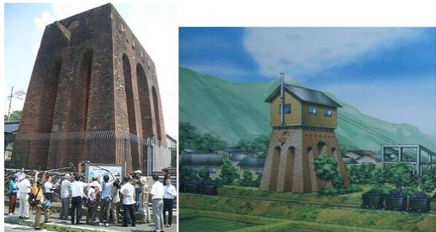
August 2006 tour by Korean relatives of Mitsubishi mine tower in Chikuho, along with historical rendering from the landmark's signboard

public. The elder nephew, a long-time member of the Bereaved Families Association for Korean Victims of the Pacific War, a citizens' lobbying group that predates the 2004 formation of the government Truth Commission, requested continued cooperation in sending back Korean bones.