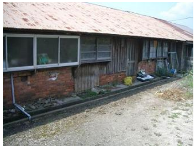
Former workers’ quarters at Mitsubishi Iizuka mine

At a September 1946 meeting involving the Korean League, Iwate prefectural officials, the Welfare Ministry and GHQ, the League was informed that the Iwate proposal of the previous June had been officially withdrawn, prompting an extended angry protest by League representatives. Agreement was reached at that meeting to pay between 1,000 and 5,000 yen to Koreans back in Korea, but that plan was rejected by corporations the following month during meetings of the construction and mining industry groups.