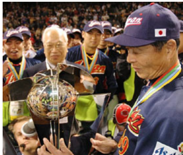
Sadaharu Oh at WBC 2006

Indeed, the smooth, much-praised performance of Team Japan in WBC 2006, an event that was widely watched in Japan, caused many Japanese baseball experts to conclude that after all, their way was best. The manager of Team Japan was none other than the aforementioned Oh, a man whose name was synonymous with backbreaking workouts during a storied career in which he hit 868 home runs.