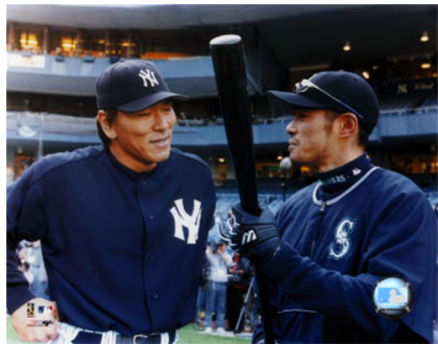
Hideki Matsui and Ichiro Suzuki

The success of players like Ichiro Suzuki and Hideki Matsui in the United States has once again demonstrated the power of sport in crossing national borders. With their stirring performances on America’s baseball diamonds, these imported players have helped to create vast new markets for Major League baseball in Japan, while teaching Americans that there is a new and very different way to approach their own national pastime. More importantly, the accomplishments of these athletes have served to influence the way many Americans and Japanese look at each other, and raised anew questions about the role of culture in sport.