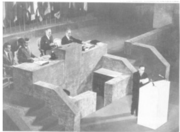
Prime Minister Yoshida Shigeru of Japan speaking at the San Francisco Peace Conference

consider solutions in a multilateral context.