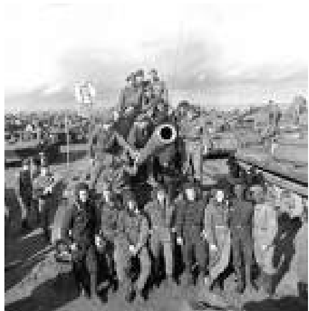
The Inchon Landing

"In the beginning, there is no rape," one ghost relates. "Far from it. Many times, after a kill, the young men stand together in a circle to pray together." Later, as the body count mounts, there is time for neither prayer nor proscriptions against rape. When the Communist Party cadres regroup and regain control, their vengeance is equally unsparing. The wounded are shot on the spot. Prisoners are lined up against the wall and executed. Young men are dragged into military service against their will and then, when the fortunes of war shift and they fall into "enemy" hands, they are killed as surely as the true believers.