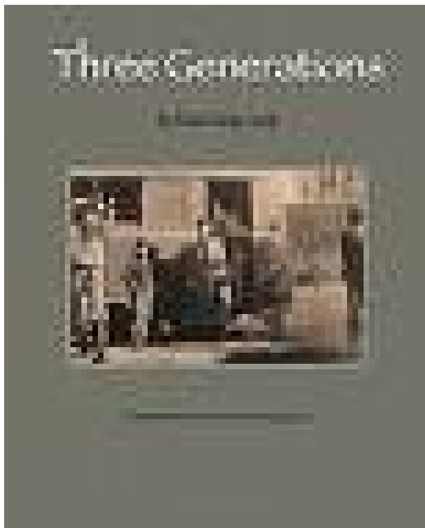
Yom Sang-seop's Three Generations

halfhearted conspiracy against the colonial authorities and inevitably fail. A father who fails to honor his ancestors or set a proper example for his son is brought low by his misdeeds. Characters speak to one another with a bluntness that seems awkward when set against, for instance, the Japanese aesthetic of indirection. The structure of the novel is uneven, the prose unremarkable. Nevertheless, in its way, Three Generations successfully portrays a society throttled by the "modernization" that Japan inflicted upon the peninsula. This delayed development, as much as the more violent policies of the era, constituted the tragedy of the colonial experience.