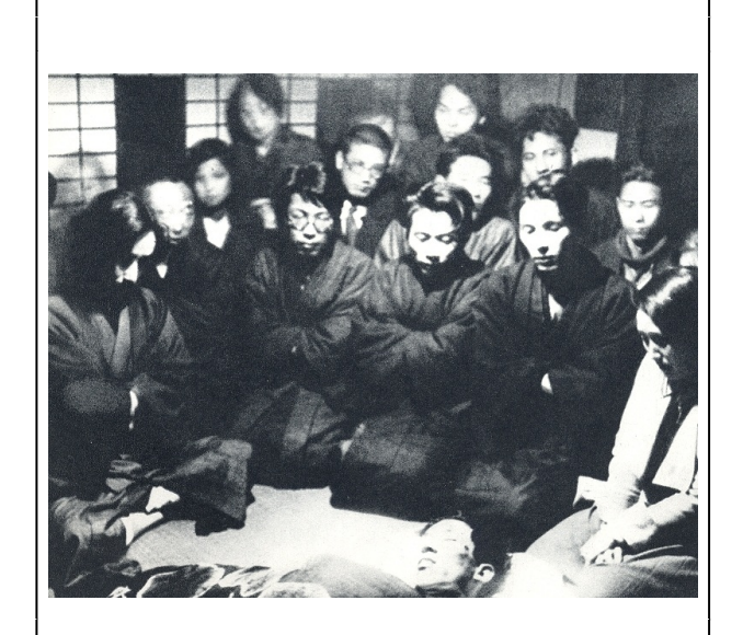
Figure 1: Mourners gathered around Kobayashi Takiji's corpse, February 1933

Torture frames the proletarian movement—from Kobayashi Takiji's story of the infamous round-up and torture of suspected leftists on March 15, 1928, to the death of Kobayashi himself by torture while under interrogation on February 20, 1933.