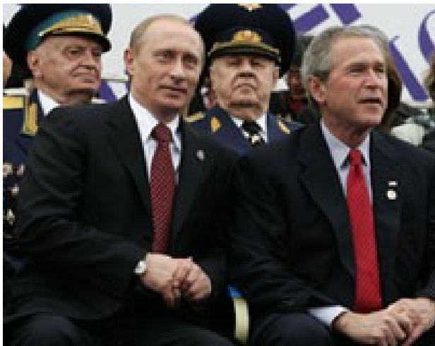
Putin and Bush in Moscow in May 2005

Last May, Moscow hosted an international gathering to commemorate the 60th anniversary of the end of the Second World War (Germany surrendered in May 1945). The ceremonies were attended by the leaders of the nations that comprised the Second World War Allies, including U.S. President George Bush and almost all the other heads of the G8 nations, as well as Chinese President Hu Jintao. This gathering on the 60th anniversary of the end of World War II also illustrated to the world that former mortal enemies Russia and Germany had achieved a historic reconciliation and a close strategic partnership. And this ceremony of reconciliation between Russia and Germany, based on the emergence of multipolarity, was actually carried out with Bush as a participant .