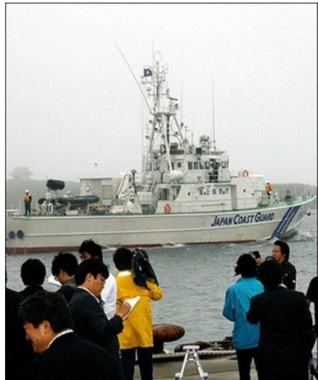
A Japan Coast Guard ship leaves for the disputed area in August 2006.

In August 2006, Japan-Russia relations were strained when a Russian patrol fired warning shots at a Japanese fishing boat, killing a member of the crew. The boat was near disputed islands—what the Japanese call the Northern Territories and the Russians call the Southern Kuriles. The incident occurred in the 50th anniversary year of the Japan-Soviet Joint Declaration (signed on October 19, 1956, and in effect from December 12 of that year). It was a powerful reminder of a lingering territorial problem, which has been the major obstacle preventing the two countries from signing a post-World War II peace treaty, as well as a continuing source of conflict.