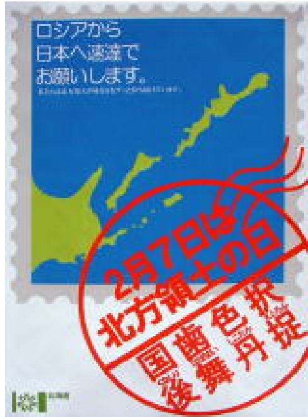
Another poster from the Hokkaido contest. It shows a stamp that requests Russia to “return the islands, speedy delivery.”

Most of the citizens of any country in the world know little about what is happening in other countries, so opinions on matters of foreign relations are molded by government propaganda. When governments inculcate the belief that “going to war will bring certain victory,” the result is bellicose public opinion. By the same token, a message that “war should be avoided” will foster public opinion that supports diplomatic negotiations.