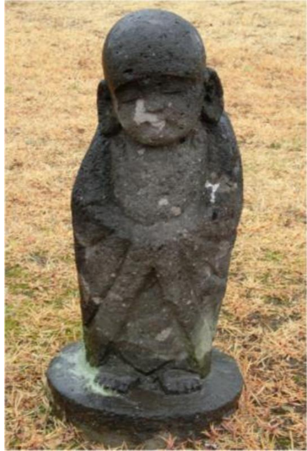
A Stone Buddha on the reclaimed land in Minamata.

In the past, we were permitted to live in this world and we had a variety of practices that helped us to feel the connection. Each one of us was connected as a living life with various other lives. We lived it out.... When I was involved with the Minamata movement, I thought, deep in my heart, that I was living on my own. But when that sense crumbled, I realised that I live, and am allowed to live by being connected to various other living things. 80