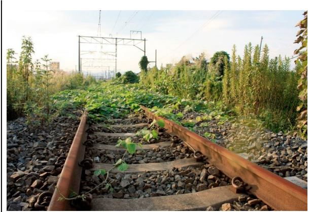
Namie became a ghost town

The crisis in Fukushima is even more serious in many respects. In Fukushima, the level of devastation is extremely high, and as at August 2012, approximately 111,000 people have been forced to evacuate by the government with no or limited prospects of returning to their homes. 35 The impact of the nuclear crisis is global rather than regional, and in respect of the ecosystem, it is not yet possible to determine its ultimate impact. The underlying power structure of the Japanese 'nuclear village' is more formidable than that of Chisso. Its power is reinforced by close links to the international nuclear regime. The causal link between exposure to the poison and illness is much harder to establish in the case of irradiation: low level irradiation does not result in distinctive symptoms as in Minamata disease; it takes many years to manifest as cancer, the cause of which is difficult to single out; and impact upon the unborn, infants and young children is unknown.