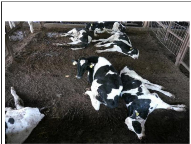
Starving cows in Fukushima

When I considered Chisso as offender, I thought that I had nothing to do with it. I thought that it was just a company, with power in the system. But when I began to perceive myself as 'another Chisso', I experienced a sense of crisis that I myself was moving away from the connectedness of life. 63