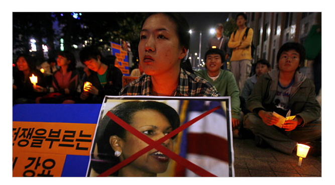
South Korean youth demonstrate against Condoleezza Rice's message

the peaceful reunification of the two Koreas. Many in South Korea also resent what they see as an attempt by the United States to drive a wedge between the Koreas. Indeed, there is a shared elite and public consensus that the Cold War ideological opposition between communism and liberal democracy is now being replaced by differences of tradition, values and social realities among nations. The search for a "post-division" identity in contemporary South Korea plays an important part in the shift away from confrontation with North Korea toward reconciling the bonds of community that was torn apart by the Cold War. Moving beyond the Cold War narrative of the Korean War, South Koreans are attempting to re-write this history by re-affirming an old mythos of national victimization and struggle that seeks to bind North and South Korea as one nation against powerful foreign foes (Japan and the United States) that would (albeit inadvertently) destroy it. It is this reasoning that has led the Roh administration to vigorously oppose U.S. pressure to participate in the Proliferation Security Initiative, claiming that it could lead South Korea to unwanted armed conflict with Pyongyang.