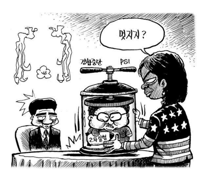
Figure 1 Condoleeza Rice places Kim Jong Il in a pressure cooker. Hangyore.

While conservative groups like the opposition Grand National Party (GNP) are not opposed to an engagement policy approach to North Korea per se, they have clashed with progressives over the Roh administration's commitment to continue inter-Korean economic projects in the aftermath of Pyongyang's nuclear test [11]. The leader of the opposition GNP, Park Geun-hae, stated that while she favors engagement, "this policy must operate within certain rules dictated by the security environment" which the North Koreans "have clearly violated by their nuclear test" [12]. It is on this basis that she and other conservatives have demanded that Seoul cease its inter-Korean economic ties with Pyongyang and agree to participate in the PSI advocated by Washington. For their part, progressives have countered that Pyongyang was forced into taking such extreme action due to Washington's hard-line policy stance. "North Korea's nuclear test," said Kim Dae-jung, "its withdrawal from the Non-Proliferation Treaty, its driving out of International Atomic Energy Agency Inspectors, and its breach of the 1994 Agreed Framework have proven that U.S. policies against North Korea's nuclear program have failed." [13]. Those favoring continued engagement with North Korea argue that further isolating North Korea will lead to a worsening security situation on the Korean peninsula and may even provoke Pyongyang to conduct a second nuclear test