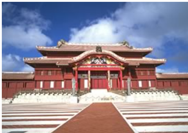
The Shuri castle

Traveling through East Asia, one can view historic imperial palaces in Beijing and Tokyo, and royal palaces reconstructed from the ruins left by fire and war in Seoul and Naha. Okinawa is the largest island in the Ryukyu archipelago. The Shuri palace in its capital, Naha, was constructed more than six hundred years ago by the rulers of the Ryukyu kingdom, which played a crucial role in maritime East Asia from the fourteenth to the seventeenth centuries. Today, it takes barely an hour to fly from Taipei to Naha, and the Shuri castle, reconstructed three times in the last century, has been designated a World Heritage Site in an attempt to evoke its former grandeur.