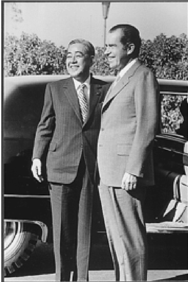
Japanese Prime Minister Eisaku Sato (left) negotiated with Richard Nixon for the return of Okinawa to Japan