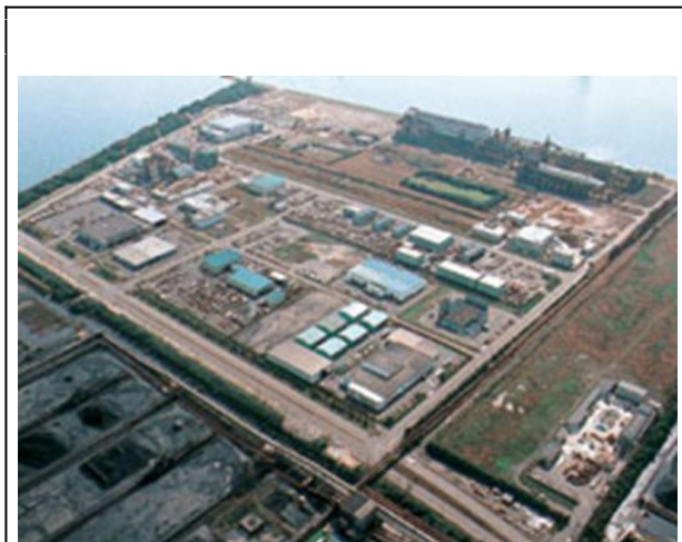
Kitakyushu’s eco-town under construction

Recycling Eco-Town: Kitakyushu was selected as one of Japan’s first four Eco-Towns in July 1997. Its focus is the facilitation of resource circulation and eco-industries. Resource circulation is connected to the zero emissions concept of taking household and industrial waste and utilizing it as raw materials for other industries. Kitakyushu’s Eco Town was designed to create this resource-recycling society and to stimulate the local economy through the growth of these environmental industries. 34 The Kitakyushu Eco-Town project is located in the eastern part of the Hibiki landfill area, which borders the sea. It is made up of the Comprehensive Environmental Industrial Complex (an area for the handling and distribution of recyclables), the Hibiki Recycling Area (business sites for lease to small and medium sized environmental enterprises) and the Practical Research Area (a centre for research and development on environmental technologies). 35