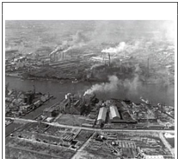
Industrial Osaka, 1955

Beginning in the 1950s and lasting well into the 1970s, Osaka suffered from severe environmental problems.