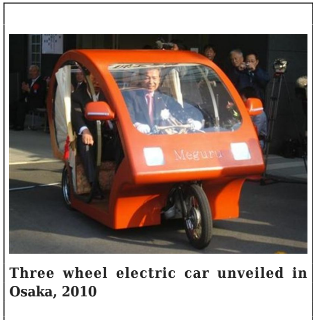
Three wheel electric car unveiled in Osaka, 2010

continued support for the promotion and development of renewable sources of energy and sustainable low energy public infrastructure. Hashimoto, while building his new party to challenge the ruling Democratic Party of Japan has, however, been notably less supportive of the city’s environmental agenda than his predecessors.