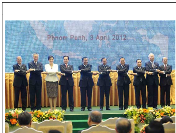
Leaders at the 20 th ASEAN Summit in Phnom Penh, April 3, 2012

In October 2003, the summit meeting of the heads of government of the Association of Southeast Asian Nations (ASEAN) issued a major statement that declared, “[a]n ASEAN Community shall be established comprising three pillars, namely political and security cooperation, economic cooperation, and socio-cultural cooperation...” 1 Each successive ASEAN Summit and Annual Ministerial Meeting (AMM) of foreign ministers has advanced this goal. It was expected that the 45 th AMM, held under the motto “ASEAN: One Community, One Destiny,” would follow its predecessors by adopting further measures to make the ASEAN Community a reality. As events transpired, differences among ASEAN states over how to manage territorial disputes in the South China Sea emerged as a litmus test of their ability to achieve an ASEAN Political-Security Community by 2015.