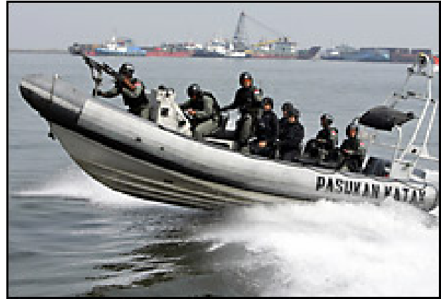
The navies of Singapore and Indonesia hold a joint exercise in August 2006

Underlining the dramatic growth in traffic in the waterway, the number of ships reporting to the Ship Reporting System (STRAITREP) [1] in the Straits increased from 43,965 in 2000 to 62,621 in 2005 [2]. Correspondingly, the size of ships traversing the Straits has also increased, as seen in Table 1. Such growth brings with it higher burdens and costs to the littoral states to provide the commensurate maritime infrastructure to ensure navigation safety to the burgeoning traffic and to protect against marine pollution. In addition, post 9-11 fears heightened perceptions of risk in the Straits, resulting in the categorization as a ‘war risk zone’ by the Lloyd’s Market Association (LMA), on grounds of the perceived threats of piracy and terrorism in the area [3].