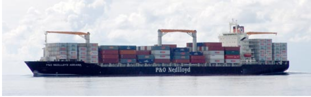
Cargo ship in the Straits

not matched their extensive usage of the Straits with proportionate contribution to the costs of maintaining and securing it.