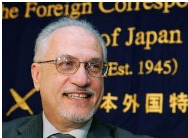
Iraqi Oil Minister Hussain al-Shahristani during a news conference at the Foreign Correspondents Club in Tokyo October 24, 2006.

Meanwhile, two Tokyo-backed oil developers - Arabian Oil Co and the Japan Petroleum Exploration Co (JAPEX) - recently renewed, for another year, their respective agreements with the Iraqi Oil Ministry to provide technological assistance, hoping to secure a share of Iraq's oil wealth in future.