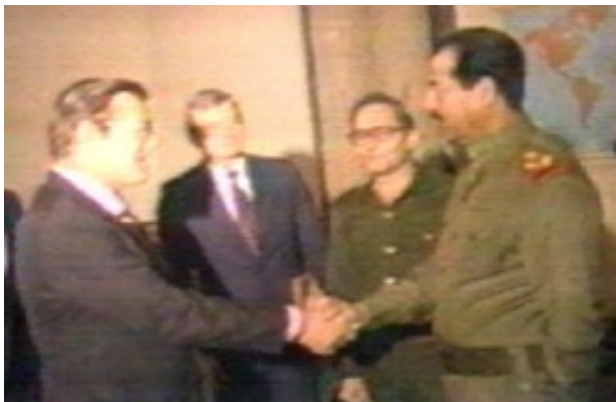
Saddam Hussain and Donald Rumsfeld in 1983

This confession was reported to the prosecutor and to the judges and it influenced their minds: it helped to convince Cooke, for instance, that "the King must die and monarchy with him." Charles Stuart had no remorse, so he deserved to die. This was Cromwell's fatal mistake: the King's execution made him a martyr, and paved the way in public sentiment for the restoration of the monarchy eleven years later. (It is a mistake about to be repeated: the execution of Saddam Hussein will most likely tip Iraq into full-blooded civil war.)