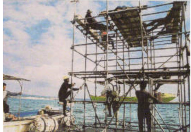
Henoko protesters occupy a platform

In October 2005, faced with the continuing opposition blockade at Henoko, Prime Minister Koizumi acknowledged that the government had been “unable to implement the (initial) relocation (plan) because of a lot of opposition.” [5] The Henoko offshore plan, like the heliport before it, was dropped. It was an admission of defeat by the state, and a tribute to the determination and persistence of the local coalition. It deserves to be recorded as one of the remarkable events in recent Japanese history: in a decade-long contest, Okinawa’s “Asterix” and “Obelisk” had defeated the nation state.