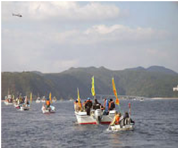
Henoko protest boats

continued without let-up for over one and a half years at the site. At a makeshift tent headquarters, Okinawan elders, some in their 80s or even 90s, mingled with fishermen and townspeople from around the island, while fishing boats, canoes, and even hardy swimmers, conducted an offshore “blockade”. All that the state’s survey team could manage to accomplish in that time was to count the dugongs (between 30 and 50) and erect four lighting beacons, which had to be dismantled with each typhoon. [4]