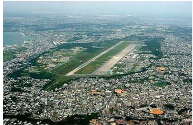
Futenma and environs

Okinawa’s capital, Naha and Okinawans continue to resist the proposed base extension at Henoko. The November 2006 election constitutes a renewed attempt to solve the festering Futenma problem. Will Okinawa be “disposed of” a fifth time?