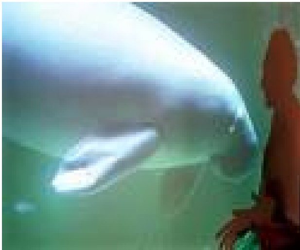
No base henoko

American tenant, for continuing to occupy Okinawan lands. Japanese officials, including then Chief Cabinet secretary and now Prime Minister Abe, lied in the parliament to cover up the deal and those who attempted to reveal what was going on were savagely prosecuted. [7] In similar vein, once again the Japanese government now promises to pay huge sums for the Futenma “reversion.” In the 2006 version, the replacement facility would comprise a large new base complex, to be built at Japanese expense at Camp Schwab, an existing US facility on Cape Henoko in close proximity to the abandoned offshore site. It would include a “V”-shaped runway of 1,800 meters, partly on land reclaimed from Oura Bay and partly on the reef, plus a pier and storage facilities where US nuclear aircraft carriers could be comfortably accommodated. [8] The heliport of 1996 had thus become a vast air and marine, military complex, with its own port and two runways instead of one.