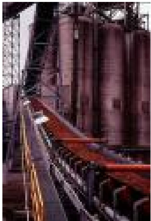
Zen-no Grain Corporation

The other side is arming itself with theories to defend creation of the limitless hunting preserve, as in calling for dismantling of Zen-noh (the National Federation of Agricultural Co-operative Associations). The other side rejects coexistence with cooperatives, let alone a mutually beneficial relationship. Zen-noh may have problems, but the important thing is to make necessary corrections in full awareness of the pressures of the times. A true crisis will ensue if this cannot be achieved. The first step is accurate recognition of current conditions.