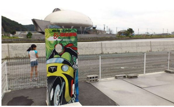
Fig.15: Photography OK: View of the ruined Ishinomori Mangattan Museum, Ishinomaki.

In any case, over a year after the disaster, when some of the worst evidence of devastation has been cleaned up and signs of reconstruction are apparent, it is not clear that the locals necessarily mind; at least not in the case of public sites. This was brought home to me during a brief visit to Ishinomaki, where I had lunch at a restaurant in the prefab Machinaka Fukkō Marushe mall opposite the island on which stand the ruins of what was once the Ishinomori Mangattan Museum. 22 In the spot where the view was best, there stood one of those figures with holes for visitors to put their face through to be photographed, popular at tourist attractions.