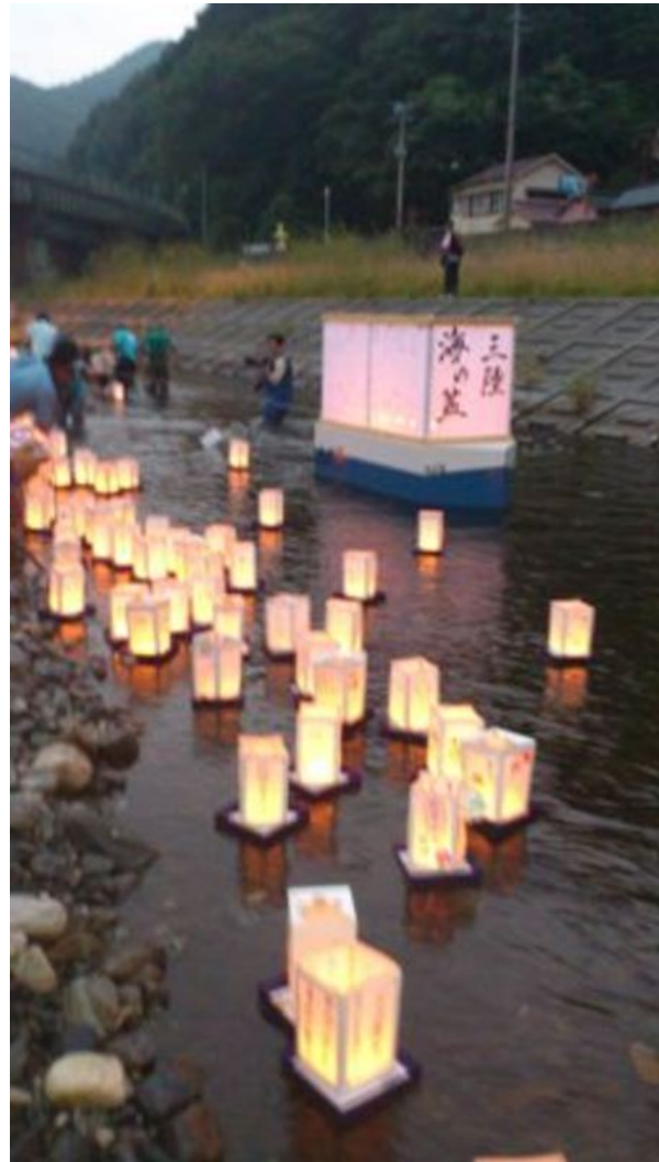
Fig. 13: Floating the lanterns, Kamaichi umi no bon, 11 August 2012.

The stage performances ended with a Buddhist rite to honour the dead conducted by local priests. Then everyone went down to the river to float the lanterns (Fig. 13). The way was lit by small lanterns created from PET bottles and Japanese paper. The bottles and paper had been lying in the corridor in the camp in Tōno over the last few days, with the invitation to make as many lanterns as possible by writing messages on the paper and folding it around the bottles. After the tōrō nagashi , we were asked to help with clearing up. Despite elaborate efforts to sort the large group of volunteers according to what time they hoped to take a bus back, there was confusion about the return journey. Eventually I joined the group boarding a bus at around 8 p.m. We took with us several plastic bags of garbage, carefully sorted in compliance with the rules of Tōno city, thanks to those volunteers whose job it had been to oversee garbage disposal, telling visitors exactly what to put in which sack or even doing it for them.