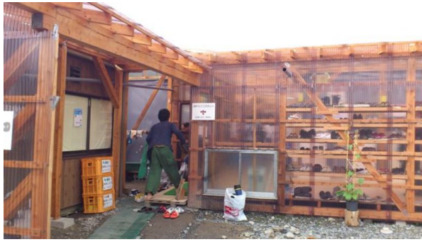
Fig. 9: Entrance to Tōno Magokoronet's headquarters and camp.

Tōno, a small town reached by a local train wending its way through the mountains, gained fame through Yanagita Kunio's (1875-1962) works on the rich folklore of the region, including Tōno monogatari (Tales of Tōno). Apart from the folklore museum, which was to host a symposium to commemorate the 50 th anniversary of Yanagita's death a few weeks later, most of the tourist sites are on the town's outskirts and conveniently explored by bicycle (rented from the tourist office). Tōno Magokoronet is organised by the local welfare authorities together with volunteers. It is financed by public money and donations. Like Kawai Camp it provides free accommodation and organises task forces in response to local needs. But the organization seemed to take more initiatives of its own (though presumably in consultation with local people), and volunteers from outside Iwate took long-term charge of projects.