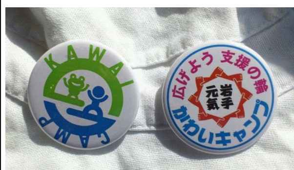
Fig. 6 Kawai Camp badges.

Kawai Camp is run by Morioka City in the building of the former Kawai branch of Miyako High School. It serves as a place for volunteers to stay from which they can organize the dispatch of volunteers to different locations in response to the needs communicated to the camp by the volunteer centres of Miyako, Yamada and other municipalities. A daily list of “needs” would be posted at around 6 p.m. and volunteers could sign up for the next day. On the day I arrived, most of the volunteers who had no special assignment were driven in minibuses to the welfare centre in Miyako, where another morning assembly awaited us and other volunteers, who had come directly to the centre. In the blazing heat (already at 10 a.m.!) we were taken through the radio gymnastics routine, before being driven, in groups of three, to the kasetsu jyutaku (temporary housing complexes, commonly simply referred to as “kasetsu” in local parlance) for activities described as a “salon.” This meant serving tea and cold drinks and socializing with whoever turned up in the common room ( danwashitsu in the smaller housing complexes, shūkaishitsu in the larger ones).