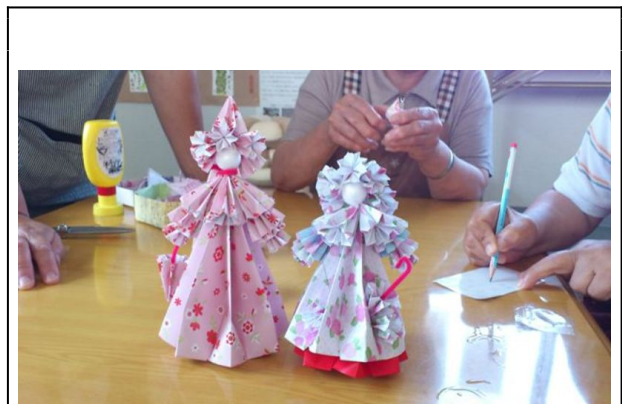
Fig. 7: Paper dolls folded by members of Kanan Niji no Kai, Kanan kasetsu jutaku , Miyako city.

On the second day we went to another kasetsu , Kanan. 9 This time nine women came in the morning and ten to twelve in the afternoon (including those who had come in the morning). They were a lively lot; as we watched the Olympics and chatted, I wondered whether they really needed us at the kasetsu . Kanan houses many people from the same community and they knew each other before the disaster threw them together in prefab housing. (It is more common for the residents in a single temporary housing unit to come from different communities, which makes it much more difficult for them to get along, organize activities in the temporary housing or plan for the future.) In the afternoon one of the residents brought material for making paper dolls (Fig.7). We were shown little carrier bags made for newspapers and given some as presents. They appeared to have a regular craft group going; one of my bags has a label saying that it was made by Kanan Niji no Kai in Miyako city Kanan kasetsu jutaku . Making, and possibly selling handicrafts, seems to be another occupation that is generally perceived as laudable; the two volunteers the previous day had passed around samples of craft items, presumably to encourage imitation.