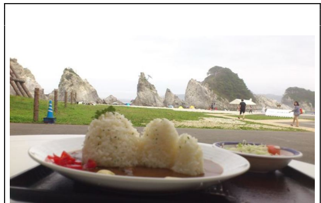
Fig. 1: Jōdogahama beach, complete with tourist amenities including a restaurant offering “Jōdogahama Curry,” is open to visitors again.