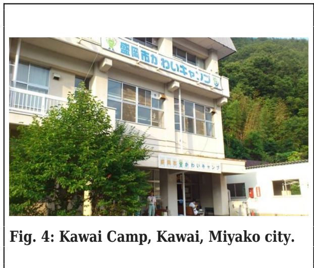
Fig. 4: Kawai Camp, Kawai, Miyako city.

The following morning I boarded the bus for Morioka, arriving at Kawai Camp just in time for morning assembly at 8 a.m. Some volunteers had come by bus from Morioka just for the day. Those who stay longer come from all parts of Japan; during the five days of my stay this included people from Fukuoka, Kanazawa, Kyoto, Hiroshima, and Tokyo as well as two from America. Between 25 and 31 volunteers (4-10 women, 17-25 men) stayed overnight at the camp, which has a capacity of 120 volunteers and at peak times accommodated around 90. At morning assembly, newly arrived volunteers were introduced by name and where they came from while departing volunteers were named and thanked for their contribution.