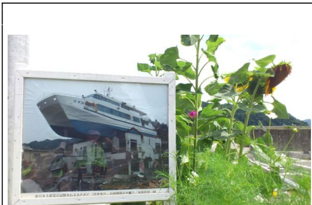
Fig. 10: Akahama, Ōtsuchi- chō ; a photograph reminds of the boat stranded on a building, now it has been removed. There is talk of constructing a replica.

Ōtsuchi- chō , the place that attained dubious fame when a picture showing a sightseeing boat stranded atop a building went around the world in the wake of the tsunami (Fig.10, 11). Tōno Magokoronet and other volunteer groups had planted flowers among the foundations and our job was to weed these flowerbeds. Caring for flowerbeds in such a wasteland of destruction seemed a bit of a luxury. However as our guide, a volunteer from Kyoto, told us, contrary to popular image, volunteering is no longer about clearing up the debris. He pointed to the cemetery on the mountainside. 12 The Bon season was approaching, when people would visit the graves and while they attended to them the ruins of Akahama would be in full view. The flowerbeds among the ruins would signal hope amid the destruction.