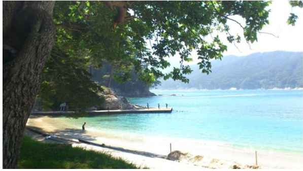
Fig. 8: Aragami beach, Yamada town.

That is not to say that the beach and the Aragami shrine had not visibly suffered. The shrine's torii looked as if it had been recently replaced and a small prefab meeting house looked intact, but the steps leading to the shrine path were badly damaged. We had been told that should a tsunami warning be broadcast (a transistor radio was switched on while we were working) we were to flee to the shrine precincts, since the water had not reached the shrine. But the very rusty box for offerings in front of the main hall made me wonder whether, like the heap of very rusty cars we had passed in the bus, the box had been immersed in sea water and the tsunami had in fact come close to the shrine building. As at Jōdogahama, a closer look at the area around the beach did reveal signs of destruction. But the sand looked clean, and even when we dug down into it and encountered tell-tale black markings that might have been caused by charred wood and other debris washed ashore, we did not in fact find any major debris. As a Kawai Camp veteran told me, however, this was in contrast to another beach where he had worked