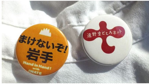
Fig.12: Badges sold to aid Tōno Magokoronet’s relief projects.

The stage performances ended with a Buddhist rite to honour the dead conducted by local priests. Then everyone went down to the river to float the lanterns (Fig. 13). The way was lit by small lanterns created from PET bottles and Japanese paper. The bottles and paper had been lying in the corridor in the camp in Tōno over the last few days, with the invitation to make as many lanterns as possible by writing messages on the paper and folding it around the bottles. After the tōrō nagashi , we were asked to help with clearing up. Despite elaborate efforts to sort the large group of volunteers according to what time they hoped to take a bus back, there was confusion about the return journey. Eventually I joined the group boarding a bus at around 8 p.m. We took with us several plastic bags of garbage, carefully sorted in compliance with the rules of Tōno city, thanks to those volunteers whose job it had been to oversee garbage disposal, telling visitors exactly what to put in which sack or even doing it for them.