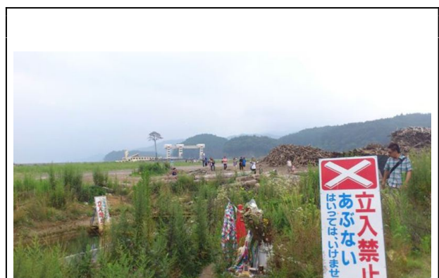
Fig.14: Access prohibited: Visiting the famous pine tree at Rikuzen Takata.

On Sunday 12 August I made my way by bus to Ichinoseki with a detour via Rikuzen Takata. Walking across the wasteland; the sheer expanse surpassed anything I had seen so far, as I came across a tour coach parked beside the coastal road. A stream of people, many with cameras, crossed the road and walked towards the sea, disregarding a notice prohibiting access to the area (Fig. 14). I soon realized that this was the site of the famous lone pine tree, the only one of an entire forest that remained standing after the tsunami; only later did I notice the signboard on the road pointing towards the “ kiseki no ipponmatsu .” 17 “Are they all tourists?” I asked a couple who had addressed me. They seemed faintly embarrassed at my question. “Most of them are probably volunteers,” I was told. This may well be true (although I had my doubts about the tour coach); after all I too was a volunteer of sorts, although not in Rikuzen Takata. What reason had I to be there, apart from wishing to see for myself the town I had heard so much about? “Disaster tourism” is an ugly expression, suggesting inconsiderate sightseers satisfying their curiosity and in the worst case hindering rescue work or exploiting the victims. 18 But, as so often, reality is complex.