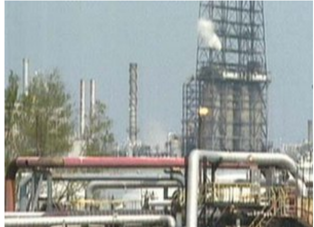
China-Iran Oil Deal