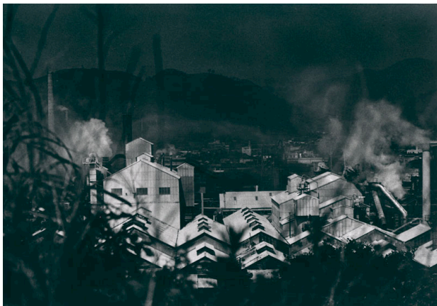
The Chisso Minamata plant

Even the chairman of Chisso was present. For the past half-century, Japan's, and the world's, environmentalists have cursed the name of Chisso. This is the company that caused Minamata Disease by dumping organic mercury into the bay, and then denying responsibility when the first victims appeared. This is the company that twisted the arms of the first impoverished victims back in 1959, forcing them to sign an agreement saying they would not sue Chisso even if in the future the company was found to be the cause. In return, they got payments of between 30,000 and 300,000 yen, minuscule sums, yet more money than most had ever seen.