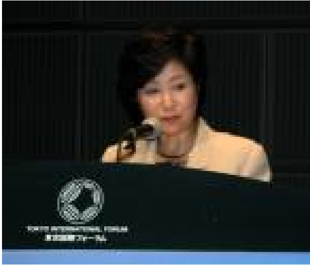
Environment Minister Koike Yuriko

Even the chairman of Chisso was present. For the past half-century, Japan's, and the world's, environmentalists have cursed the name of Chisso. This is the company that caused Minamata Disease by dumping organic mercury into the bay, and then denying responsibility when the first victims appeared. This is the company that twisted the arms of the first impoverished victims back in 1959, forcing them to sign an agreement saying they would not sue Chisso even if in the future the company was found to be the cause. In return, they got payments of between 30,000 and 300,000 yen, minuscule sums, yet more money than most had ever seen.