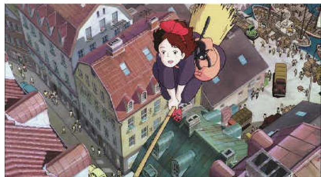
A scene from Kiki's Delivery Service

Toshio Suzuki, a wry, articulate man with close-cropped silver hair and an elfin grin, is Miyazaki's producer and longtime collaborator. "When silents moved to talkies, Chaplin held out the longest," he told me. "When black-and-white went to color, Kurosawa held out the longest. Miyazaki feels he should be the one to hold out the longest when it comes to computer animation." Miyazaki lavishes particular attention on his backgrounds, which are full of painterly flourishes. I'd never really noticed the colors in an animated film until I noticed his. Skies and seas are saturated in strangely emotional blues; wet halos surround the red lantern and absinthe-green neon signs in "Spirited Away"; in "Kiki's Delivery Service," the young witch's dress isn't quite black—it's the smudged purple of the darkest plums.