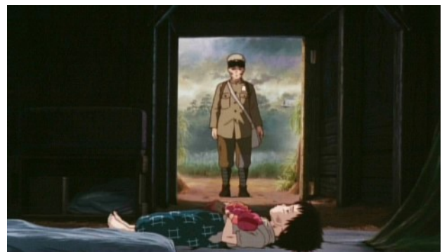
A scene from Grave of the Fireflies

Takahata and Miyazaki, who worked together so closely for years, have lately moved in different directions. Takahata is more interested in literary and film theory, more cerebral and less enamored of magic. His films are not for children, and “Grave of the Fireflies” could easily have been a live-action film. Takahata is sixty-nine, but he has a formidable head of dark hair and a handsome, unwrinkled face. “With Miyazaki, you have to totally believe in the world of the film,” Takahata told me. “He is demanding that the audience enter the world he has created completely. The audience is being asked to surrender.” He paused. “I want the audience to have a little distance. My relationship with him is limited now. We are friends but we don’t have a direct working relationship.”