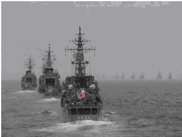
Japan's coast guard in the East China Sea

Japan has been competing over scarce energy resources with China. The two energy-hungry Asian powers have been locked in a simmering dispute over gas reserves in the East China Sea. Furthermore, they have each lobbied hard for alternative routes for a pipeline from eastern Siberia's oilfields to Pacific Rim nations. The Sino-Japan rivalry over energy resources shows signs of spreading to the Middle East.