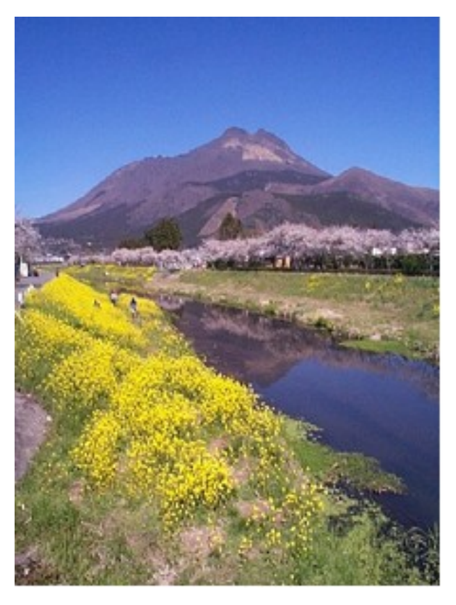
Yufuin in Oita Prefecture

The prefecture's OVOP movement has been fairly successful. Oita's shiitake mushrooms account for by far the highest share, 28%, of the domestic market. Also, Oita is the only place in the country where kabosu limes are produced. Oita's distilled-barley spirits, consumed with kabosu lime juice, is famous for its smooth taste. Oita prefecture also has two of Japan's biggest spa resort towns, Beppu and Yufuin. More than 10 million bathers flock to Beppu, while more than 3.8 million spa lovers visit Yufuin, every year.