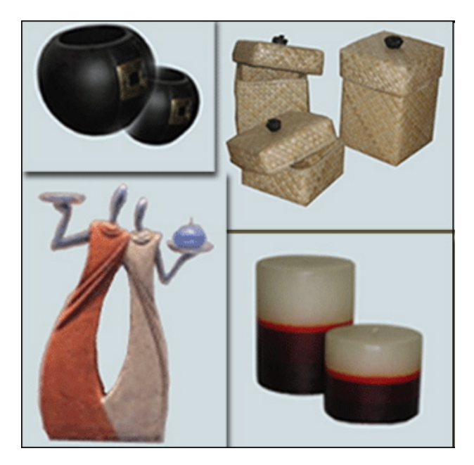
Products from Thailand's OTOP movement

Thailand is one of the most enthusiastic countries about OVOP. Prime Minister Thaksin Shinawatra introduced the Thai version of OVOP, known as the One Tambon, One Product (OTOP) movement, in February 2001 to promote local industry through manufacturing of specialty products based on the native culture, tradition and nature. The tambon is the country's local administrative unit equivalent to a village or town.