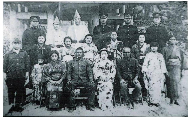
Japanese and Ayatal in Taroko

negotiated with the indigenous peoples about access to land. They also took good care of the aboriginal people with education and health care, even sending the sick to be treated at Taiwan Imperial University hospital if necessary. This theme of the Japanese era as the “good old days” is not uncommon in Taroko reminiscences of the era, even as the same interlocutors also acknowledge the pain of colonial occupation.