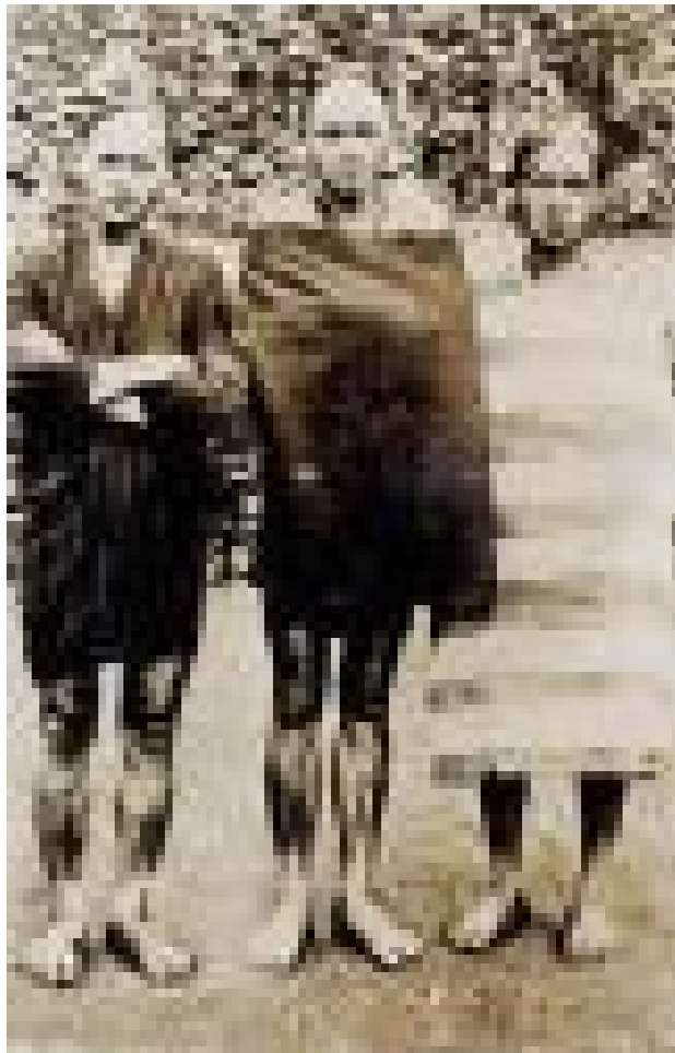
Mona Rudao center

In the months leading up to the local elections in December, 2005, the KMT continued to appropriate indigenous social memory by covering their headquarters in Taipei with a large image of Wushe hero Mona Rudao. This tactic has the twin effect of appealing to Mainlander anti-Japanese sentiments and of positioning the KMT as the voice of indigenous peoples. The party's consistent support in indigenous areas, including overwhelming support in the December 2005 local elections, suggests that this strategy has contributed to electoral success. May Chin's protests are only a part of this larger struggle.