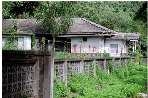
Return our land

military expeditions, including the electric fences, Japanese artillery, and Taroko people resisting with simple hunting guns. Many of the photos were taken from memorabilia albums sold in Japan at the time to celebrate the victory. The final panel of the exhibit, a drawing of the sun setting over the mountains, brought the issue of resistance to contemporary Taiwan. The text said that the Taroko came down from the mountains, saw their land occupied by outsiders, and “have not yet been able to return to their ancestral lands.” Putting it into context, museum visitors could recognize that the arrival of the Republic of China and later the establishment of the Taroko National Park were precisely extensions of imperial conquest, the replacement of one colonial overlord with another. This written discourse repeated Taroko activist Tera Yudaw’s contention that the Taroko National Park is a form of “environmental colonialism” (Tera 2003: 169).