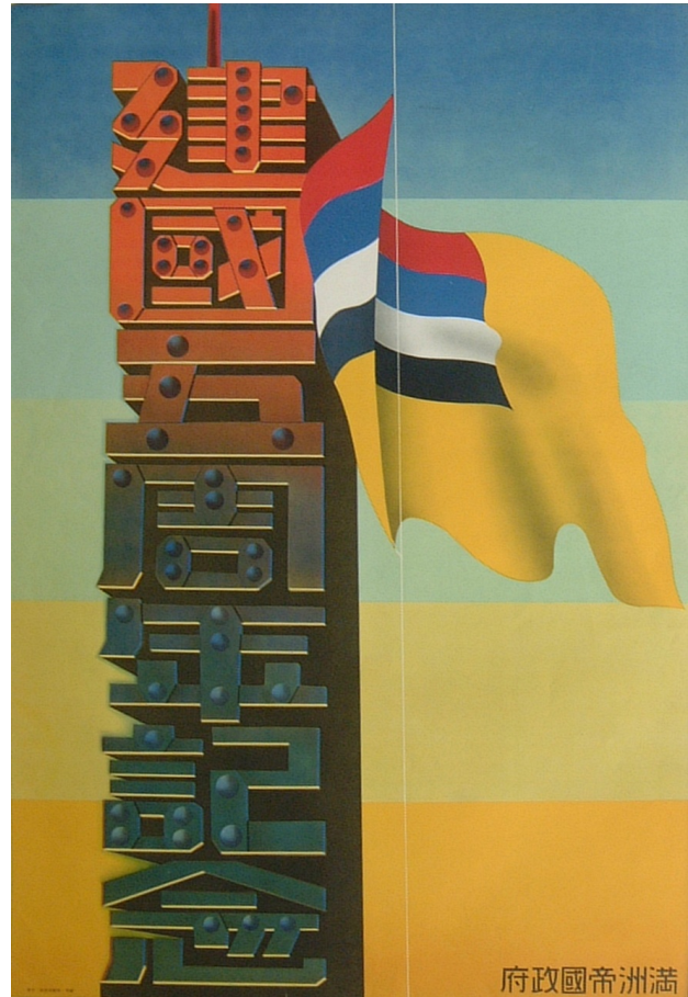
Manchukuo's industrial production