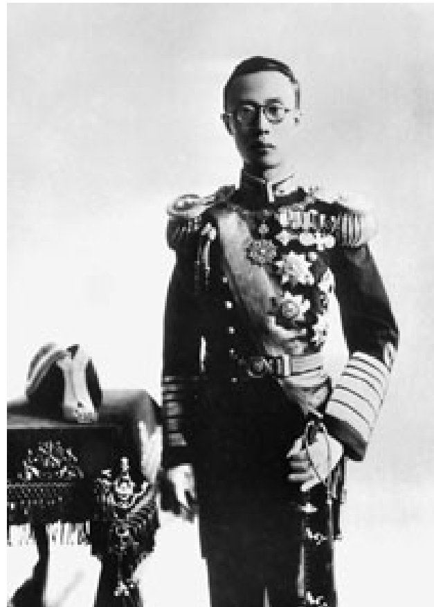
Pu Yi as emperor of Manchukuo

hierarchical “family state” ideology with pan-Asianism.