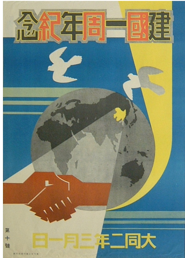
The "concord of nationalities"

The second legitimacy claim made by the puppet regime was that it represented the “concord of nationalities” ( minzoku kyowa ) a conceit that was supposed to represent two advances over older colonial ideas. Not only was the concord supposed to reject exploitation and the reproduction of difference between ruler and ruled, but it was also designed to counter the homogenization of differences that nationalism had produced and that had led to nearly insoluble conflicts. By allegedly granting different peoples or nationalities their rights and self-respect under a state structure, Manchukuo presented itself as a nation-state in the mode of the Soviet “union of nationalities”. Among others, Tominaga Tadashi, the author of Manshu no minzoku ( Nationalities of Manchuria ), wrote copiously about the early Soviet policy towards national self-determination. It was a policy that fulfilled the goals of federalism and protected minority rights, while at the same time it strengthened Soviet state and military power particularly with regards to separatism in the old Tsarist empire. Thus, nationalism ought not to be suppressed, but rather utilized positively for the goals of the state.(34)