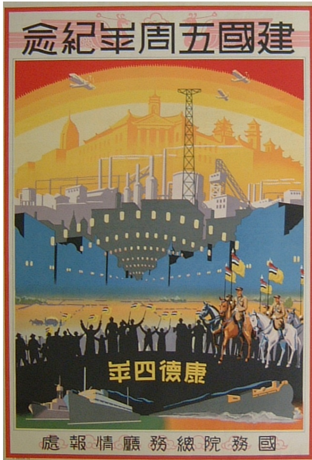
Manchukuo's future, 1937

The other side of this developmental state was the brutality of an occupying army. The massacres of the resistance, the notorious human experiments with bacteriological toxins developed by Unit 731 in Harbin, the dispossession of agricultural land from Chinese farmers, and other brutal crimes have been well recorded. Manchukuo presents us, on the one hand, with a record of cruel violence; and, on the other hand, with the record of a developmental state.