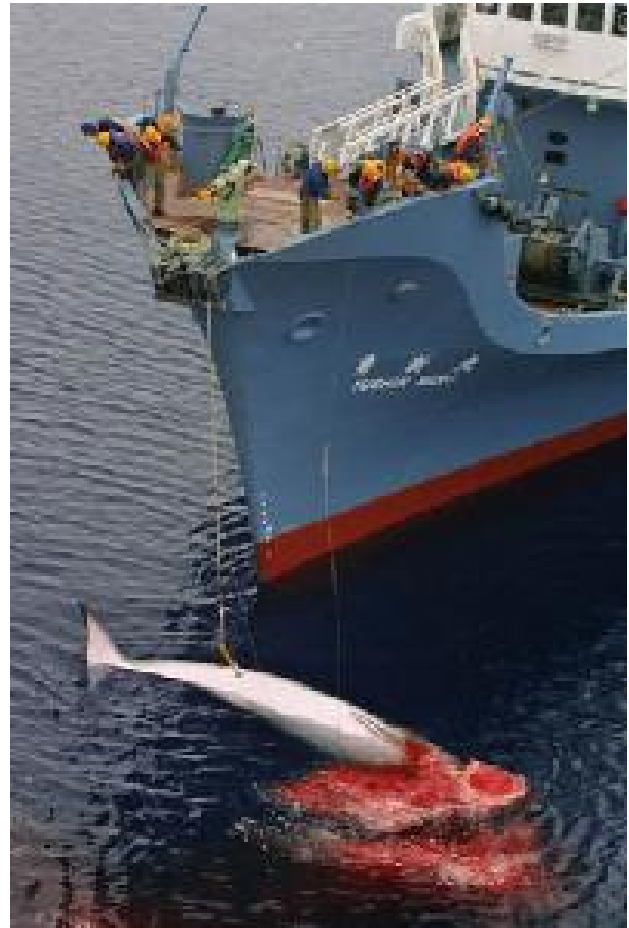
Japanese whaler in the Antarctic

What especially angers environmentalists is the fact the Japanese hunt is taking place in the Southern Ocean Whaling Sanctuary, an area encompassing 21 million sq miles of sea around Antarctica which the IWC declared off-limits for whaling in 1994. Japan ignores it.