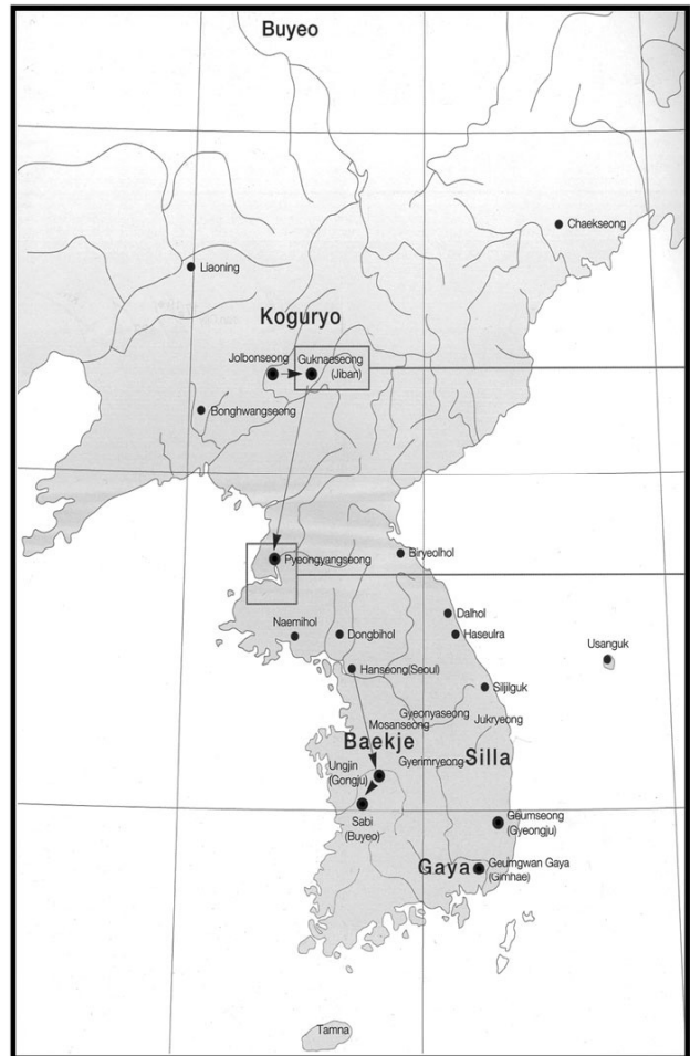
Figure 1 : Map of Koguryo/Gaogouli

debate between China and Korea. It concerns the history and heritage of Koguryo/Gaogouli (37BC-AD668) [1], which is often referred to as one of the ancient Three Kingdoms of Korea, along with Paekche and Silla. Koguryo/Gaogouli encompassed a vast area from central Manchuria to south of Seoul at the height of its power, around the fifth century (Im Ki-hwan 2004: 98).