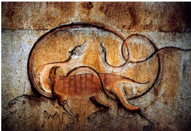
Figure 6: A snake crossed with a tortoise. Kanso Middle-sized Mound, 7th Century in the Kitora Tomb in Asukamura, Nara prefecture, Japan.

they were influenced by Japan's funerary culture. As examples of Koguryo's influence on Japan's funerary culture, the Takamatsu Tomb and the Kitora Tomb in Japan have been cited. [31] She concludes that the influence of Koguryo seen in Japan and the Korean peninsula demonstrates its prominent position as a culturally powerful regional state (Kang 2004: 106-107). As such, the Koguryo archaeological remains represent the legacy and hegemony of regional culture.