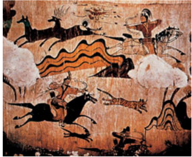
Figure 4 : A hunting scene in the Tomb Muyongchong, in Ji'an, located in contemporary Jilin Province, China.