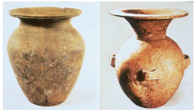
Figure 5: Jars excavated on Mount Mandal, Pyongyang, North Korea.

Koguryo's relics are highly regarded in the rivalry between China and Korea. This indicates that heritage constitutes an influential part of cultural hegemony in East Asia and also, a powerful part of the cultural and historical patrimony of the people, both in Korea and especially in the Northeast Provinces in China. Kang Hyun-sook (2004), professor of Ancient Art in South Korea, maintains the distinctiveness and influence of Koguryo culture in East Asia in underlining that the Koguryo tombs with murals were not mere imitation of their Chinese counterparts and that