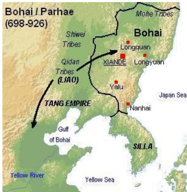
Figure 2: Map of Bohai/Parhae

“During the Sui and Tang, the Mohe lived along the Songhua and Heilong Rivers. In the second half of the seventh Century the Sumo-Mohe tribe grew stronger. At the end of the seventh century Da Zuerong, the leader of the Sumo, united all tribes and formed a government. Later the Tang Emperor Xuanzong proclaimed Da Zuerong King of the Bohai Commandery. After this proclamation, the Sumo-Mohe government called itself Bohai.” [3]