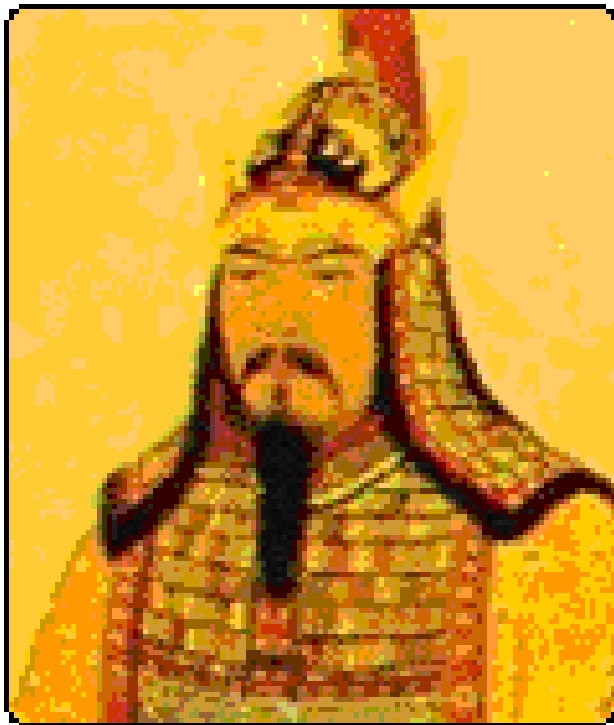
Figure 9: King Kwanggaet'o the Great

Last but not least, questions of gender are ignored in mainstream national historiography on Koguryo. National heroes are constructed as masculine: for example, the ancient historical figures like King Kwanggaet'o the Great and his son King Changsu are presented as a source of Korean national pride. Their conquests in the Northeast provinces are attributed to the victory of Korea's virile "national masculinity". Accordingly, in praising masculine achievement in history, women become invisible and images of male domination are reinforced.