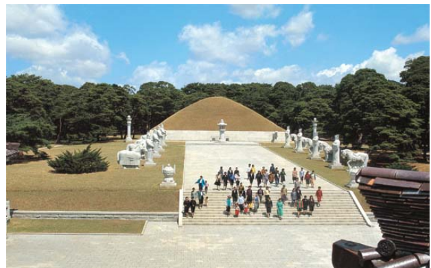
Figure 3: King Tongmyong’s Mausoleum, North Korea

Not only Koguryo history but also its relics constitute a source of tension between China and Korea. The conflict already surfaced in differences in interpreting the ancient history amongst North Koreans and Chinese in the joint archaeological excavation of the early 1960s . The political implication of archaeologists’ work was demonstrated when the joint archaeological project was halted. Koguryo tomb murals are found on both sides of the Chinese-North Korean border as well as in South Korea (Yeo 2005). So far, in total over 10,000 tombs belonging to the Koguryo