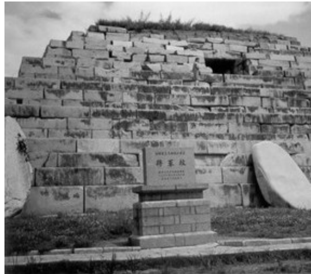
Figure 10: Tomb of King Changsu