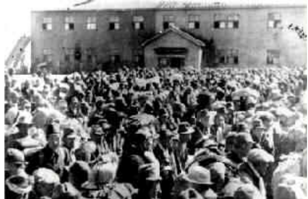
Captured Japanese in a Soviet prison camp

all of this in violation of the Potsdam Proclamation, which Japan had accepted before surrendering.[18] While Japanese acts of brutality towards Allied POWs rightly attracted outrage and punitive justice, following on from the violation of a neutrality pact and the refusal to honor a surrender, the Soviet use of Japanese POWs as slave labor in the immediate postwar era was Stalin’s third major contravention of the tenets of international law in the Far East to go unquestioned by any postwar tribunal.