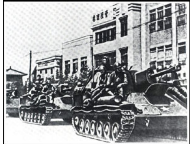
A Soviet tank column

It’s known as the Gegenmiao Incident. It was a massacre at a place called Gegenmiao in Manchuria in which one thousand several hundred Japanese refugees were attacked by a Soviet armored unit. Over one thousand people were slaughtered. The tanks came after eleven in the morning, attacking as we fled from the fighting around Kou’angai. It was a crazy mix of sound from the tank engines and machine guns. Everyone was screaming as they ran to get away. Some people fell hit by bullets; others were crushed by tanks.[6]