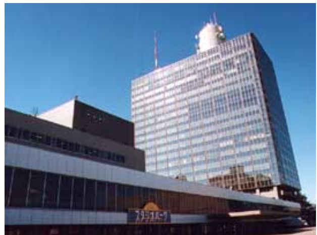
Tokyo headquarters of NHK

magazines hit the newsstands. Though the monthlies offer longer and more analytical articles, they commonly pick up themes first aired in the weeklies, and some, like the market leader Bungei Shunju (commonly abbreviated to Bunshun ) echo the heated rhetoric of their weekly counterparts.