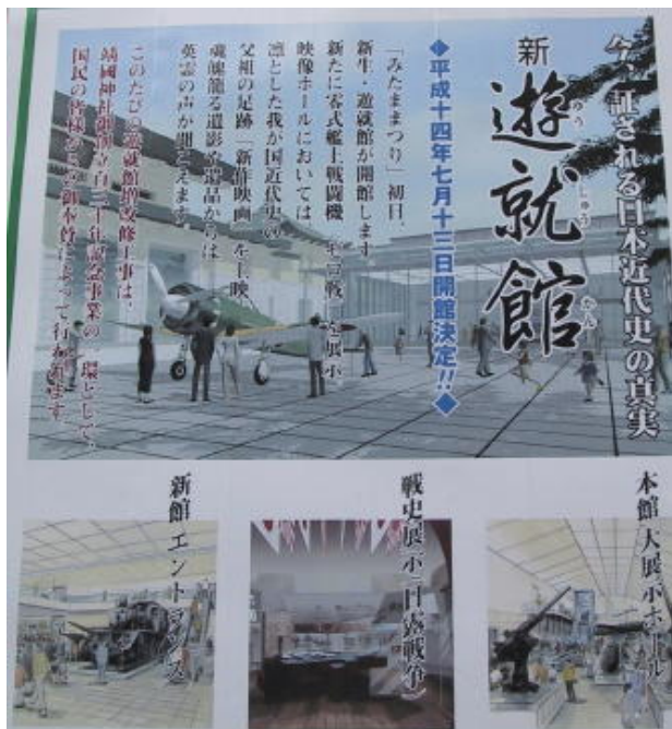
Yushukan war history exhibits at Yasukuni Shrine

ethnocentric statements about Nanjing that have emanated from China and the United States. Indeed, each has fed off the others. In China, many accounts and museum exhibits dealing with Nanjing have fostered a self-congratulatory nationalism, calculated to strengthen loyalty to the government while paying scant attention to the facts, as opposed to reiterating an iconic position such as the 300,000 deaths. The same may be said, from across the ideological barricades, of the Yasukuni Shrine’s museum presentation of the Pacific War with its complete lack of reference to Japanese atrocities. Moreover, some American works on Nanjing have ascribed the atrocities to an alleged Japanese racial character or unique cultural behavior, ignoring the widely shared racist thought that lay behind the war’s savagery. [7]