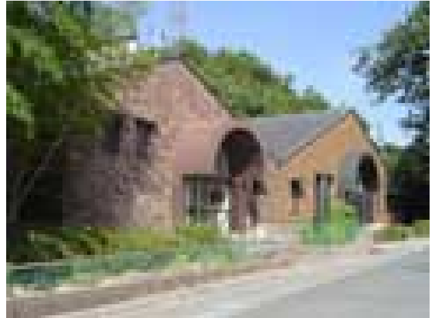
Okunoshima Poison Gas Museum, site of poison gas production during the Pacific War

Many public local museums as well as private museums, both large and small, were opened or renovated from the late 1980s on. They commemorate not only the sufferings of Japanese war victims, but also the losses and hardships of non-Japanese. These museums include the Okunoshima Poison Gas Museum in Hiroshima prefecture(1988), the Osaka International Peace Center (1991), the Kyoto Museum for World Peace at Ritsumeikan University (1992), the Kawasaki Peace Museum (1992), the Peace Museum of Saitama (1993), the Hiroshima Peace Memorial Museum (1994), Oka Masaharu Memorial Nagasaki Peace Museum (1995), and the Nagasaki Atomic Bomb Museum (1996). In addition, a number of “mobile peace museums” — that is, special exhibitions that underscore Japanese wartime atrocities—traveled across Japan and attracted tens of thousands of visitors.