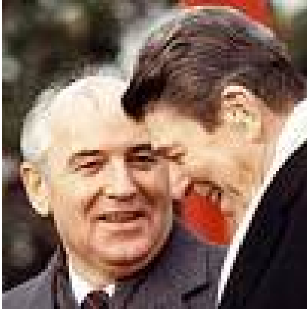
Reagan and Gorbachev

New York Times recently asserting that the US-Russian relationship today "is far better than it was 15 years ago.")