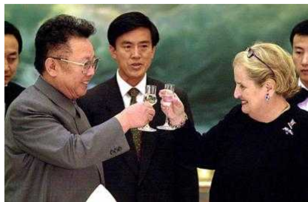
Secretary of State Madeleine Albright meets Kim Jong-il in Pyongyang

In 1994 the Clinton administration reached agreement with North Korea on a package that contained many of the elements of a solution of the second type. In exchange for freezing its nuclear weapons program, North Korea was promised light water reactors and heavy fuel to solve its energy problems. The implicit understanding, certainly on the part of North Korea, was that the agreement could pave the way for a Treaty ending the Korean War and establishing US-North Korean diplomatic relations. The failure of the Clinton administration to follow through on any of these promises led to the collapse of the deal, despite last-minute efforts to revive it in the final months of the Clinton administration.