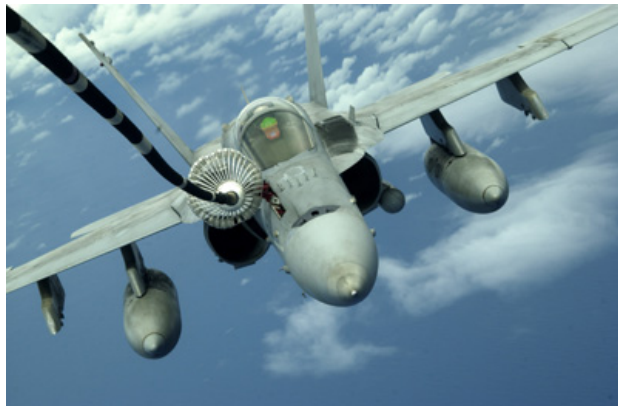
A US F/A-18D from Marine Corps Air Station Iwakuni, Japan, refuels

China's participation for the first time as an observer in the Valiant Shield exercise is a further blow to North Korea, perhaps even a factor provoking to July 4 missile tests. Strategic shifts in the region, particularly those involving the US-Japan and US-ROK military alliance surely increase North Korean sense of isolation. On the other hand, to the extent that the ROK can use its strengthened security relationship with the US to increase awareness of the regional possibilities of an accord, positive outcomes seem possible. Prior to a peace treaty ending the Korean War, a US-North Korea and North Korea-South Korea détente, it seems inescapable that South Korean governments will continue to hedge their bets between strengthening the US-ROK relationship and further opening toward the North.