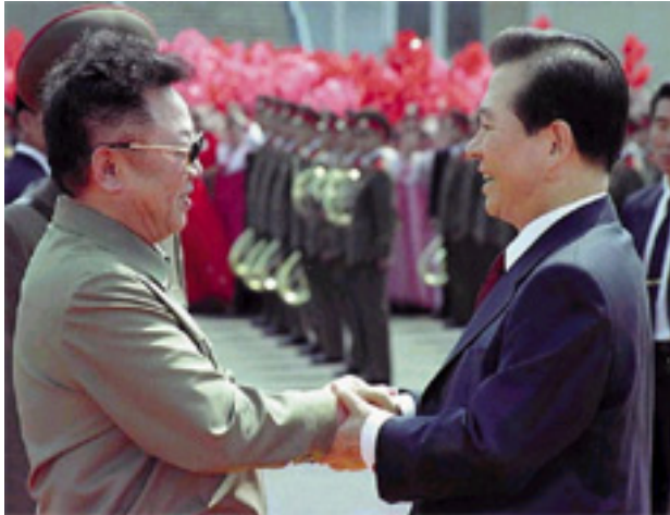
Kim Dae Jung and Kim Jong-il meet in Pyongyang in 2000

Both positions presume the elimination or freezing of the North Korean nuclear program. Both presume fundamental transformation of North Korean politics, economics and society, and a more harmonious regional order based on an end to the Korean War and rapprochement involving North Korea, the US, Japan, South Korea, China and Russia. But whereas the first is predicated on regime change, the second looks toward a softer, even peaceful transformation of the position of the two Koreas within a broader regional consensus. Without the agreement of the regional powers, above all the US and China, however, neither position can be effectively implemented.