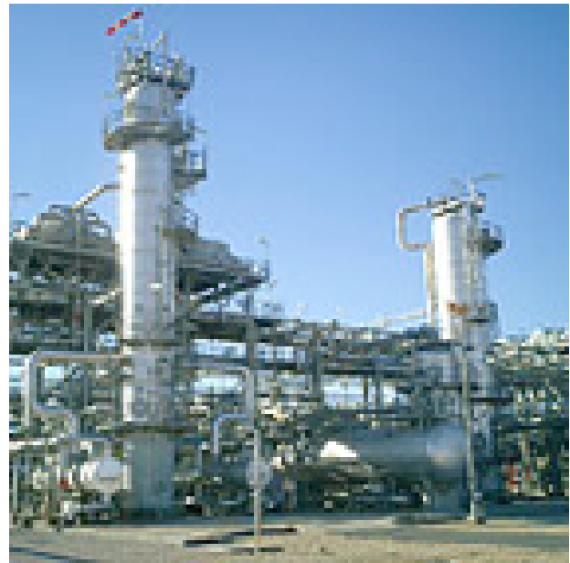
Teikoku Oil's gas project in Algeria

the West Bakr and Southeast July blocks. Teikoku Oil also made inroads into the Algerian oil and gas sectors several years ago. It is participating in development projects in Ohanet and El Ouar I and II blocks. Teikoku Oil has also participated in an offshore oil development project in the Democratic Republic of Congo since the 1970s.