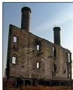
Remains of one of Unit 731's germ factories in Manchuria serve as a reminder of the atrocities that took place during Japan's occupation of China during World War II

During the 1981 burst of publicity, Justice B.V.A Roling, a Dutchman and the only surviving judge from the International Military Tribunal for the Far East in Tokyo, Asia's Nuremberg, complained that no word about biological warfare had been offered in evidence. He wrote: "It is a bitter experience for me to be informed now that centrally ordered Japanese war criminality of the most disgusting kind was kept secret from the court by the U.S. government."