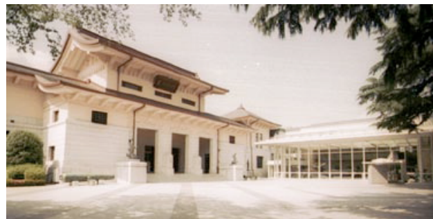
The Yushukan Museum

However, Roh countered the Japanese delegation by throwing a close breaking pitch, saying, "If possible, I wish to visit Yushukan," referring to the museum that stands on the grounds of Yasukuni Shrine. Both visiting and receiving Japanese and South Korean officials are engaged in a psychological war in which foreign and domestic situations are intricately entangled.