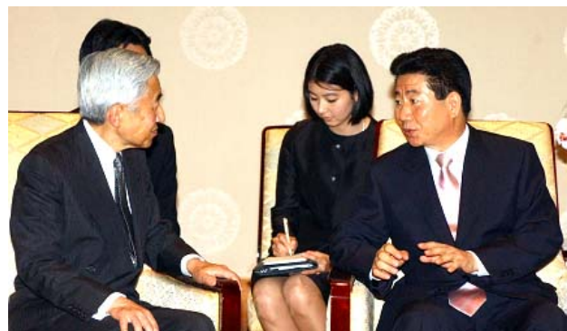
Emperor Akihito meeting with South Korean President Roh Moo-hyun

The same pattern applies to the administration of Fukuda's father, former Prime Minister Fukuda Takeo, under whom Fukuda served as an aide. In 1978, the senior Fukuda significantly advanced "Japan-China reconciliation" by signing the Japan-China Peace and Friendship Treaty by placating rightist opponents. It was also around the same time that the Fukuda administration paved the way for the enactment of the Gengo (the name of a Japanese era) Law in 1979. This law, too, was established in response to fervent requests from rightists.