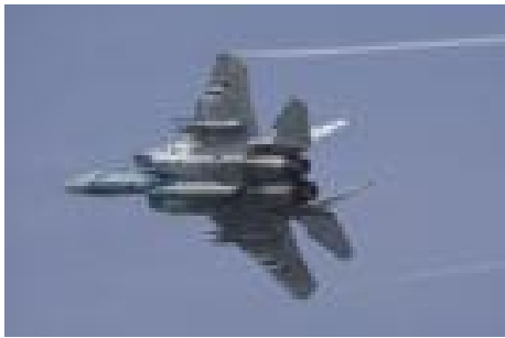
A Japanese F15 fighter

order); and budgeted in 2004 for two 13,500-ton aircraft carriers (coyly described as “helicopter carriers”). Behind Japan stands the military colossus of the United States. Moreover, Japan launched two reconnaissance satellites in March 2003 to spy on North Korea. Were North Korea to launch spy satellites into the skies above Tokyo or Osaka, a Japanese preemptive strike to get rid of them would no doubt follow quickly.