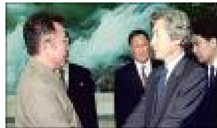
Kim Jong Il and Koizumi Junichiro in Pyongyang

The September meeting between the Japanese and North Korean leaders was tense and dramatic. It lasted a single afternoon. Koizumi reportedly took with him his own bento lunchbox to Pyongyang and then brought it back to Tokyo that night, unopened. The two leaders agreed to "make every possible effort for an early normalization of relations." Koizumi expressed "deep remorse and heartfelt apology" for "the tremendous damage and suffering" inflicted on the people of Korea during the colonial era, while Kim Jong Il apologized for the abductions of 13 Japanese and for the dispatch of spy ships in Japanese waters.