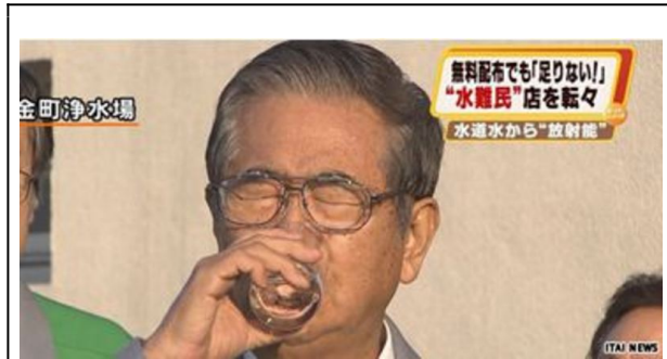
Ishihara’s televised tap water performance

water from the Cyclator, without announcing that the wastewater from the acetaldehyde plant, which contained mercury, was not being run through the Cyclator. An eerily similar performance took place on March 24, 2011 when Tokyo’s Governor Ishihara Shintarō drank a glass of tap water on national television to “prove” that it was safe from radioactive contamination.