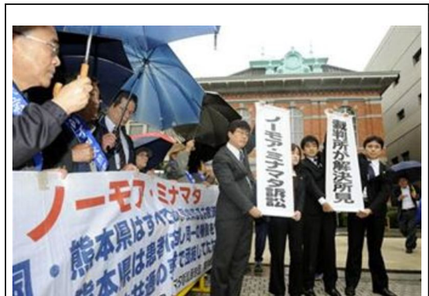
“No more Minamata” protestors during the 2010 court case

Supreme Court decision in a case pressed by patients who had refused to drop their lawsuit. The court found the government’s certification standards too strict, and found the prefectural and national governments at fault for allowing the disease to spread after it was discovered. The government refused to relax its certification standards, and thousands more applied for certification or filed lawsuits. In 2010 the government reached agreement on a plan to compensate many more people—possibly bringing the total up to 35,000—but many lawsuits continue.