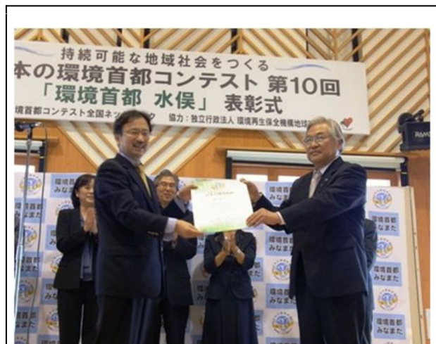
Minamata named Japan’s “Environmental Capital” in 2011

Anger over Minamata and other major pollution incidents contributed to the flowering of citizen activism in the late 1960s and early 1970s, and helped force the government and the ruling Liberal Democratic Party to become more responsive. The Environment Agency was created. Laws were passed in a Diet session nicknamed the “Pollution Diet” to require meaningful reduction of at least some types of pollution, particularly air pollution. Japanese companies found ways to profit from the need for pollution controls, and consumers became better informed. By the 1990s Minamata was a national leader in recycling. Whether the disasters of 2011 will be a significant turning point, and the nation will redefine itself (perhaps by phasing out nuclear power and becoming more of a global leader in renewable energy), or whether March 11 will merely accelerate the slide of Japan’s global relevance and the depopulation and economic decline of its rural northeast Pacific coast, is yet to be seen.