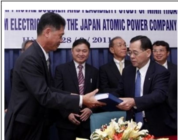
Noda and Vietnamese Premier Tan Dung forge a nuclear technology agreement

of the 1973 agreement burdened a declining Chisso, a deal was brokered by the late 1970s to have Kumamoto Prefecture sell bonds to finance loans to Chisso, with the understanding that the central government would buy most of the bonds and that Chisso would not repay the loans. In 2010 a bill was passed to split Chisso into two companies, one doing business and one existing only to pay compensation, so that those debts would not drag it down.