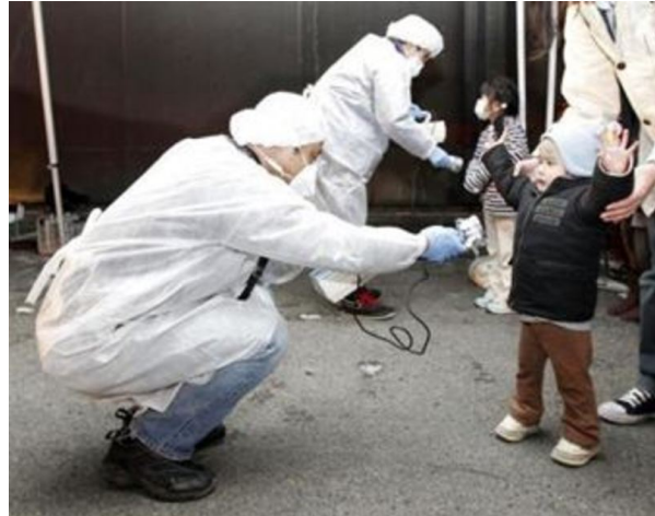
Children measured for radioactivity following the March 11 disaster

Both Minamata and March 11 polluted the sea and took the lives or destroyed the livelihoods of many people who had depended on fishing, often for generations. Those who were still able to fish found themselves unable to sell their tainted catch.